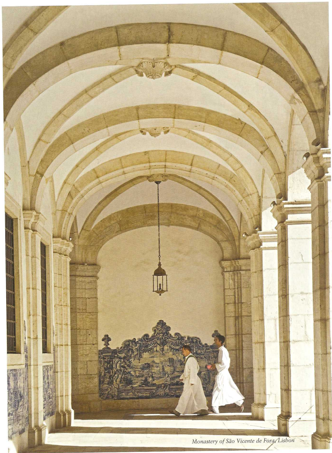
Monastery of São Vicente de Fora, Lisbon