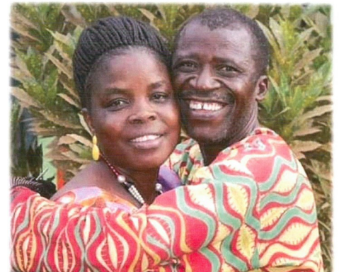
Many attended his memorial service.