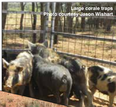
Large corral traps