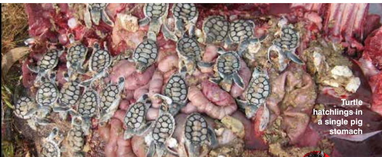
Turtle hatchlings in a single pig stomach