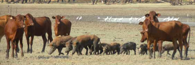
The risk of disease transfer from pigs to livestock is high.

These exotic diseases could cause enormous economic losses and threaten animal health and meat exports if they were to enter and spread across the country. A recent example of an exotic disease outbreak, made worse by feral pigs, occurred in Eastern Europe in 2014 when dead wild boars tested positive to African Swine Fever (ASF). Virulent ASF kills almost 100% of infected animals. Any pig living with infected animals must be culled to prevent the spread of this highly contagious and very stable virus.