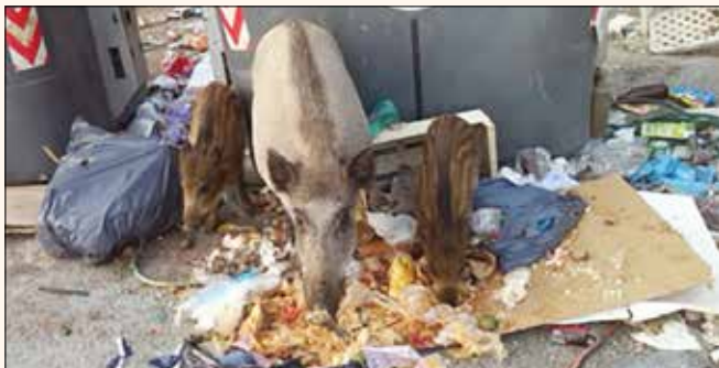
Pigs raid rubbish facilities even in major cities including Barcelona (this photo), Berlin and Hong Kong