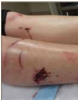
Pig inflicted bites on dog walker's legs in Canberra