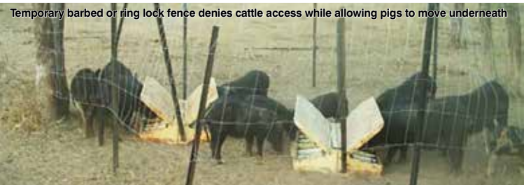
Temporary barbed or ring lock fence denies cattle access while allowing pigs to move underneath

Prop the lids open for one night, and fill bait boxes with the same feed as on previous days. If this feed is consumed well, close the lids and keep feeding the pigs with the same feed for another day or two to ensure the pigs are now using the boxes. Pigs readily learn to open the lid if food is inside but other animals find it very difficult. Top up the feed each day to hold pigs at the site.