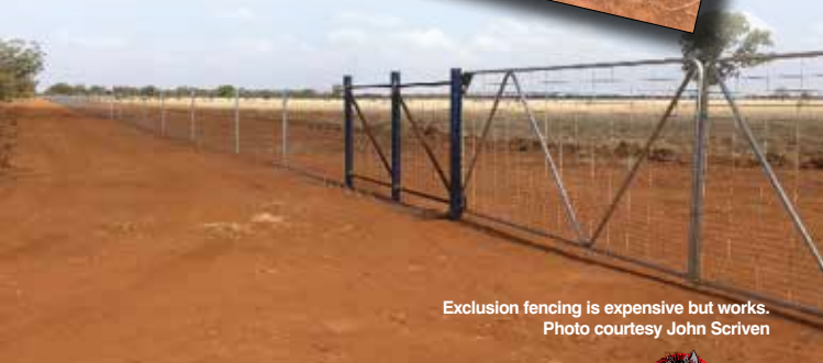
Exclusion fencing is expensive but works.