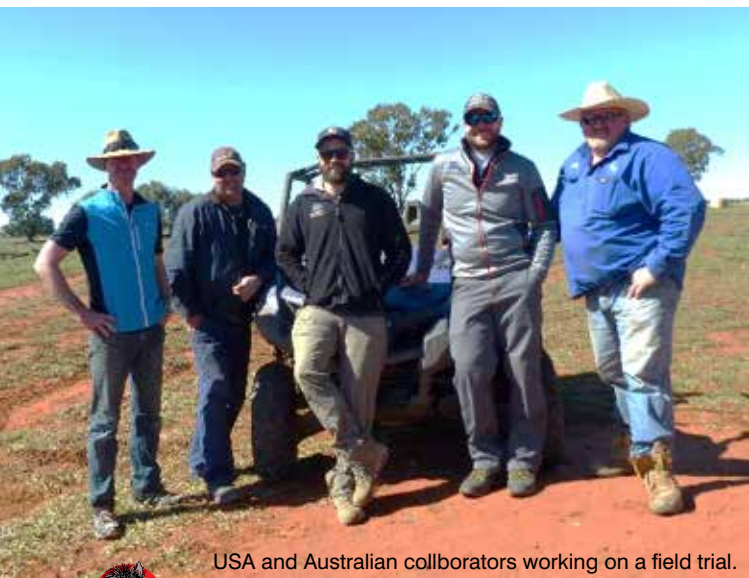
USA and Australian collaborators working on a field trial.

HOGGONE® bait contains peanuts and should not be used or handled by people with nut allergies