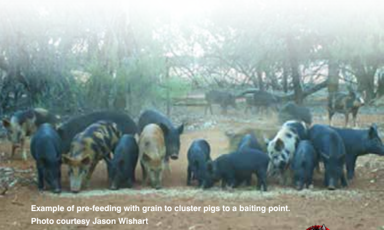
Example of pre-feeding with grain to cluster pigs to a baiting point.

If no feed is consumed after 5 days try again at another site where there is evidence of pig activity. Bait stations should be far enough apart to prevent animals feeding at multiple sites. Distances between stations depend on a number of factors including resource abundance, topography, climatic conditions, pig density and home range size. A good starting point is about 0.5 to 1.5 km apart. As a general guide, it is better to have two bait stations, each attracting a 20-pig sounder, than to wait longer in the hope of attracting 40 pigs from two sounders to a single bait station.