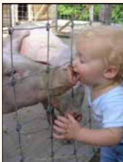
As pigs encroach on the urban fringe interactions with humans increase