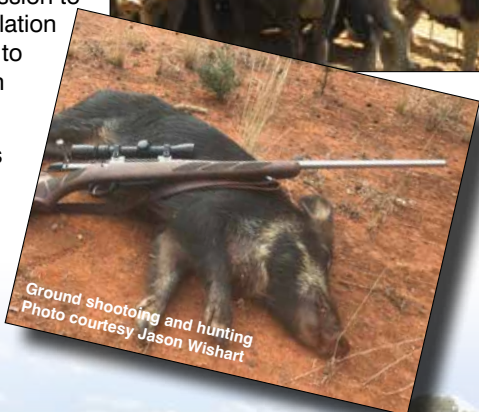
Ground shooting and hunting