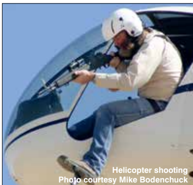
Helicopter shooting