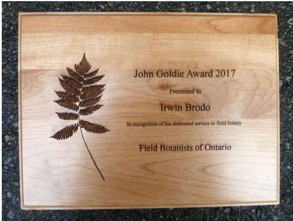
The 2017 John Goldie Award plaque.