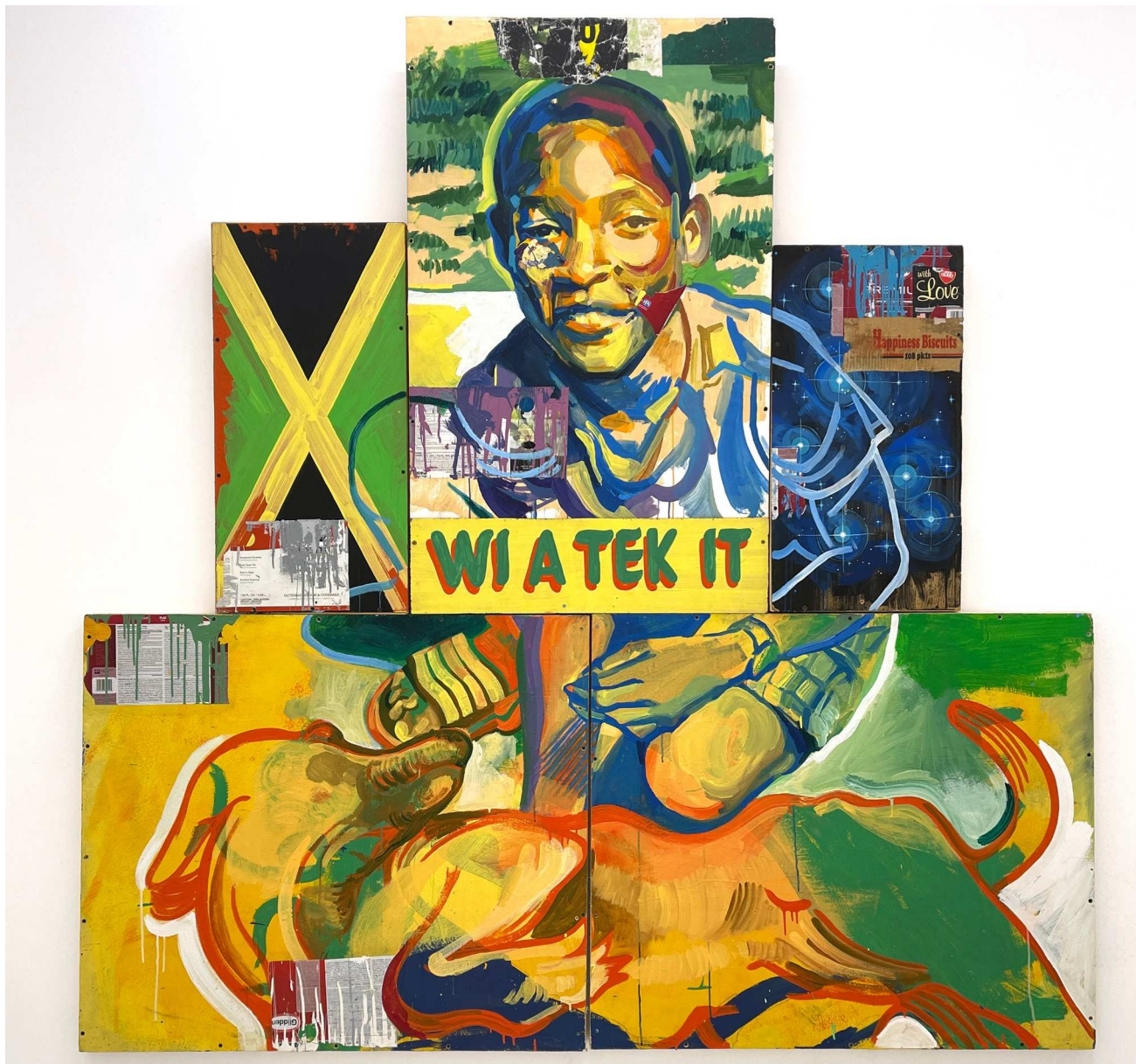
Boy with Dog at Night in Jamaica, 2019 Acrylic, posters, paper, paint labels on wood 84 x 84 in