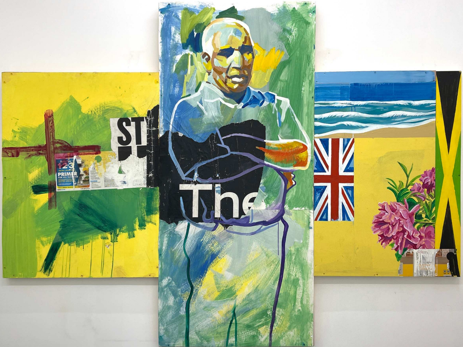
The Saint (Edgar as Apostle Paul) , 2021 Acrylic, posters, paper, paint label on canvas 72 x 72 in