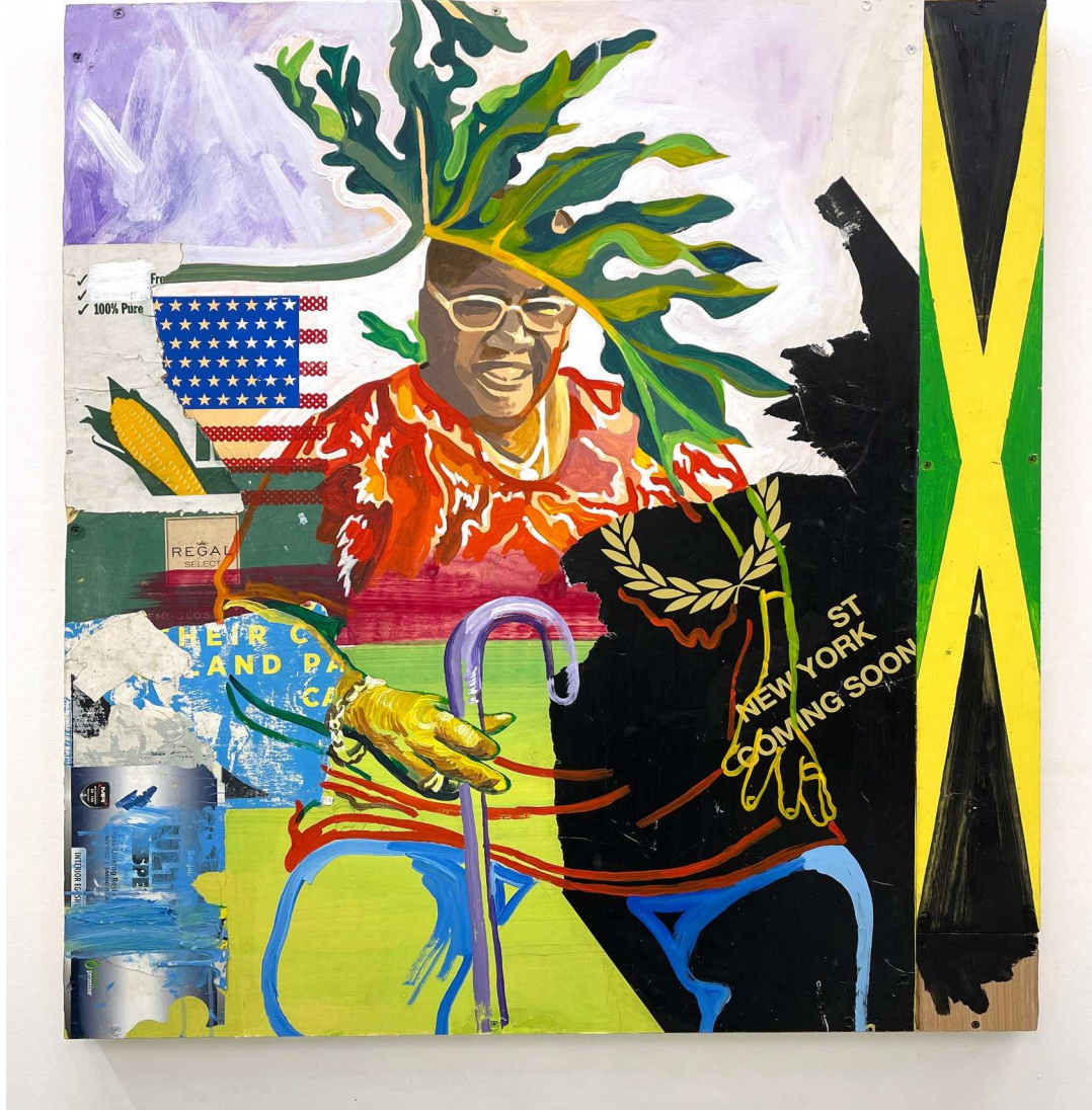
Regal Soon Come, 2020 Acrylic, posters on paper and wood 42 x 42 in