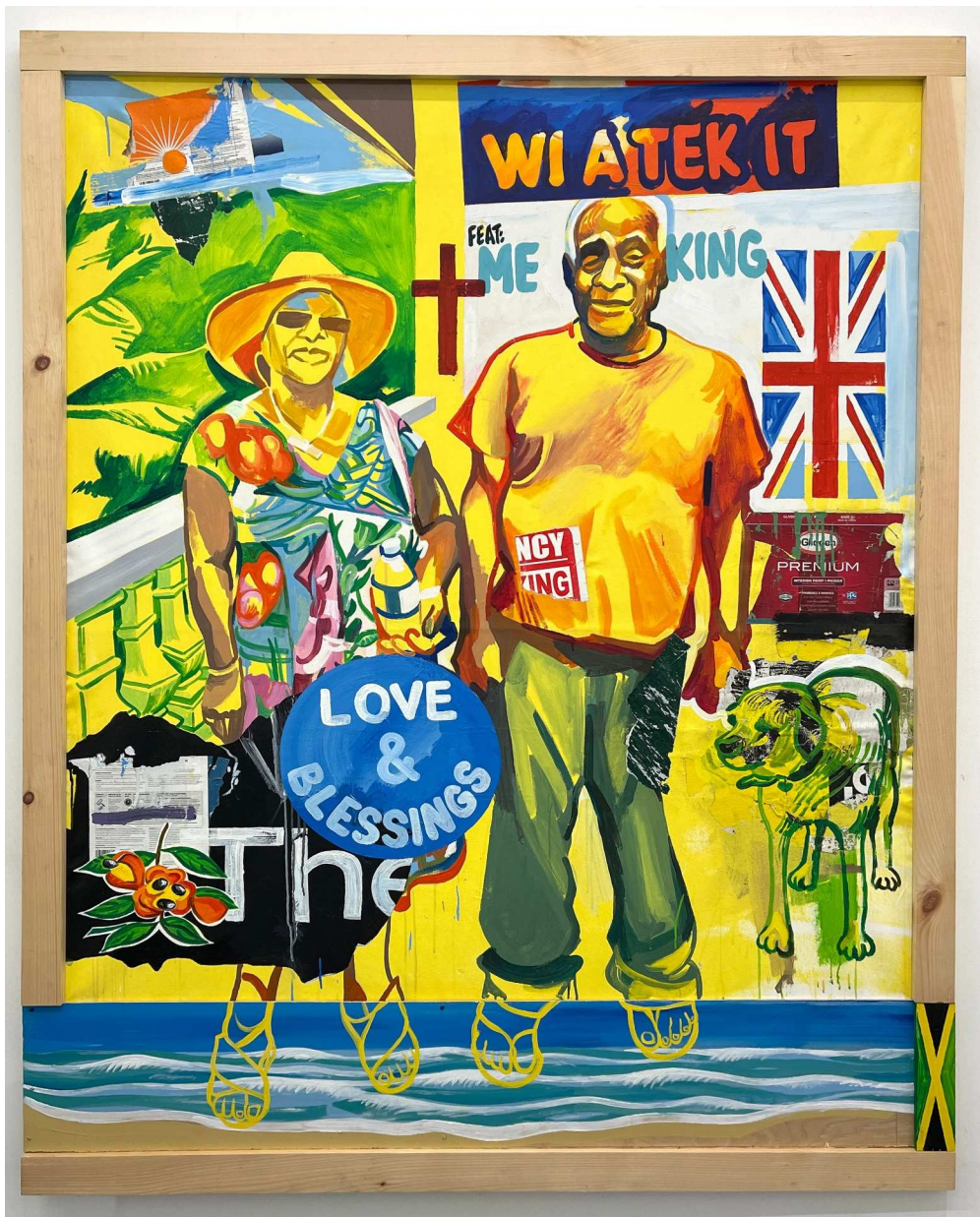
Hattie & Edgar in Mandeville (Abraham & Sarah), 2020 Acrylic, posters, paper, paint labels on canvas 72 x 60 in