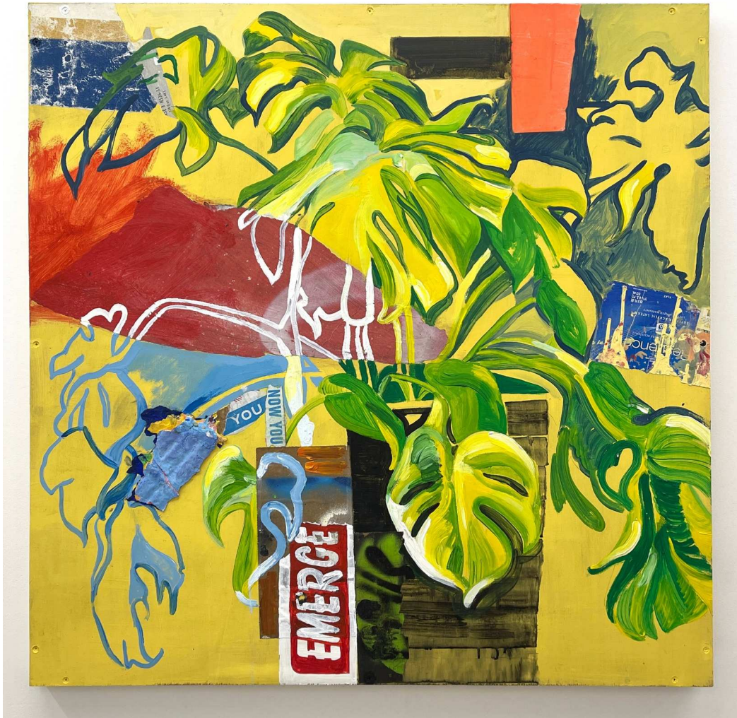
You Now You (Emerge) , 2021 Acrylic, tempera, paper, paint labels on wood 36 x 36 in