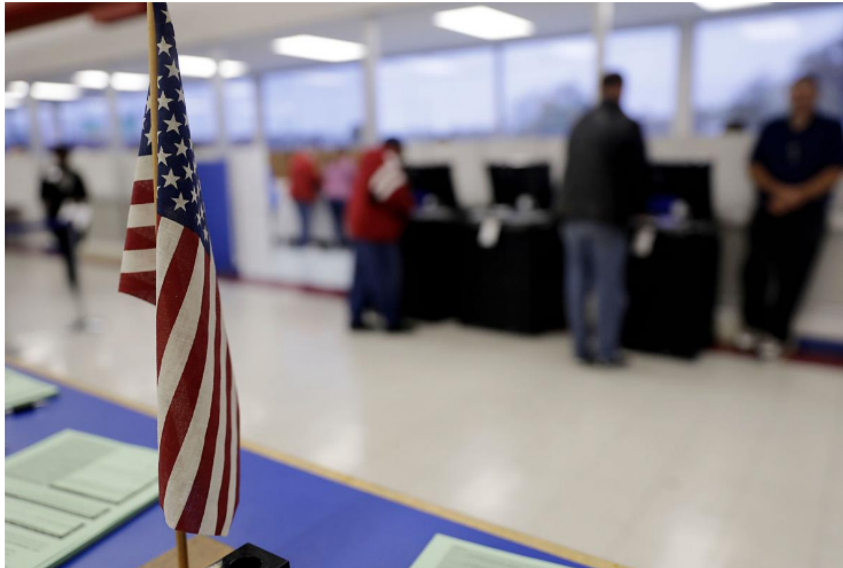
Voters cast ballots on the first day of early voting at the Tulsa County Election Board on Nov. 1.