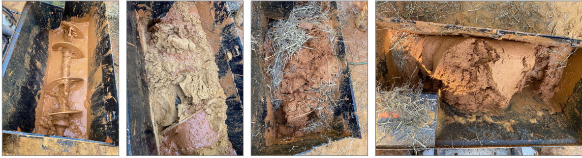
Figure 2. Making cob with a skid steer 1-4.

ment from using both traditional straw and hemp fiber in our cob mix (we later determined that if the hemp fiber is longer than about 6", it tends to clump together in the mixer). Each batch has to dry 28 days and the lab was busy, so this step ended up taking about four months.