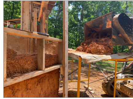
Figure 3. Skid steer dumping cob on scaffolding.

of an air-filled cooler is basically what modern housing aspires to: a tight building envelope with no thermal mass. There's nothing to hold the temperature. So constant regulation is needed via mechanical heating and cooling equipment, and peak loads all occur at the same time.