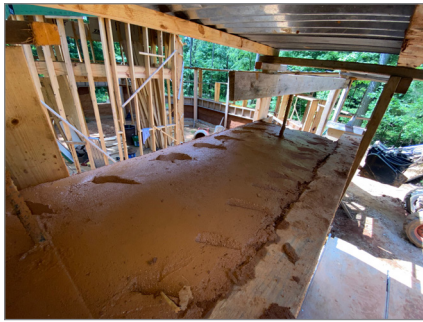
Figure 8. Flattening last full layer of cob for bond beam.