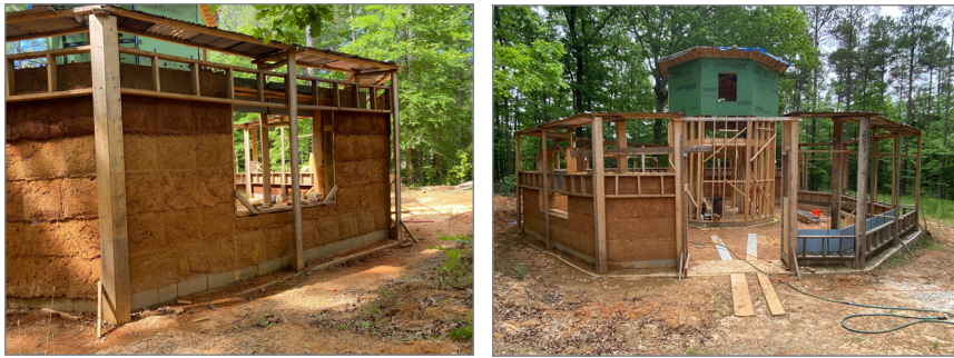
Figures 4 & 5. Cob slipforms.