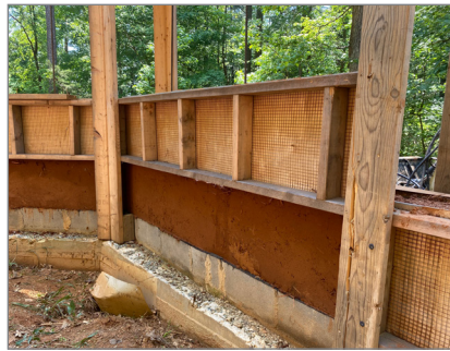
Figure 9. Inside of wall is smooth for finish plaster.

spaced approximately 23" apart, resting on the 28" wide concrete footing. The foundation for the cob wall was one row of CMUs two wide to elevate it off the footing, and the bases of the vertical 2" x 6"s were pushed up against the CMUs with 2" x 4" spacers and braced to keep them in place. Cross-sections connecting the 2" x 6" were placed every 3'. 3" screws and some 6" ledger lag screws were used for fasteners.