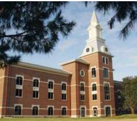
FUNCTION DISGUISED The new parking structure at Baylor University in Waco, Texas, features a façade design that disguises the building's function and smoothly blends in retail space. Adapting parking structures for future uses will require adapting exteriors to reflect those purposes.