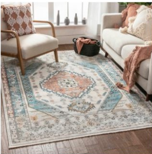
Indira Oriental Blue/Ivory Area Rug