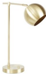
Orb Desk Lamp, Gold

BETTER HOMES & GARDENS walmart.com $49.97