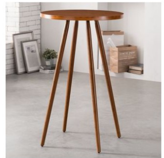
Walnut Orchard Hill Bar Height 28" Dining Table