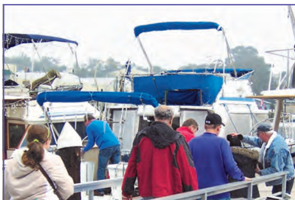
TOP: SANTA WITH CANDACE WICKHAM BOTTOM: LIFEHOUSE BOARDING THE BOATS