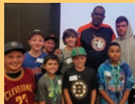
Celtics Legend/Announcer Cornbread Maxwell