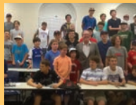
National NFL Expert Ed Werder