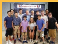
National Star Sal Pal