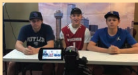
More sports anchoring