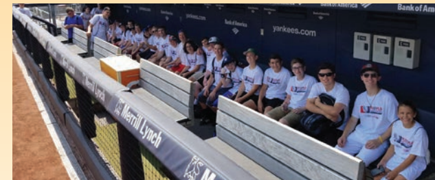
Campers at Yankee Stadium