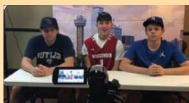
More sports anchoring