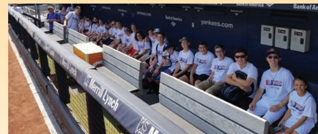
Campers at Yankee Stadium