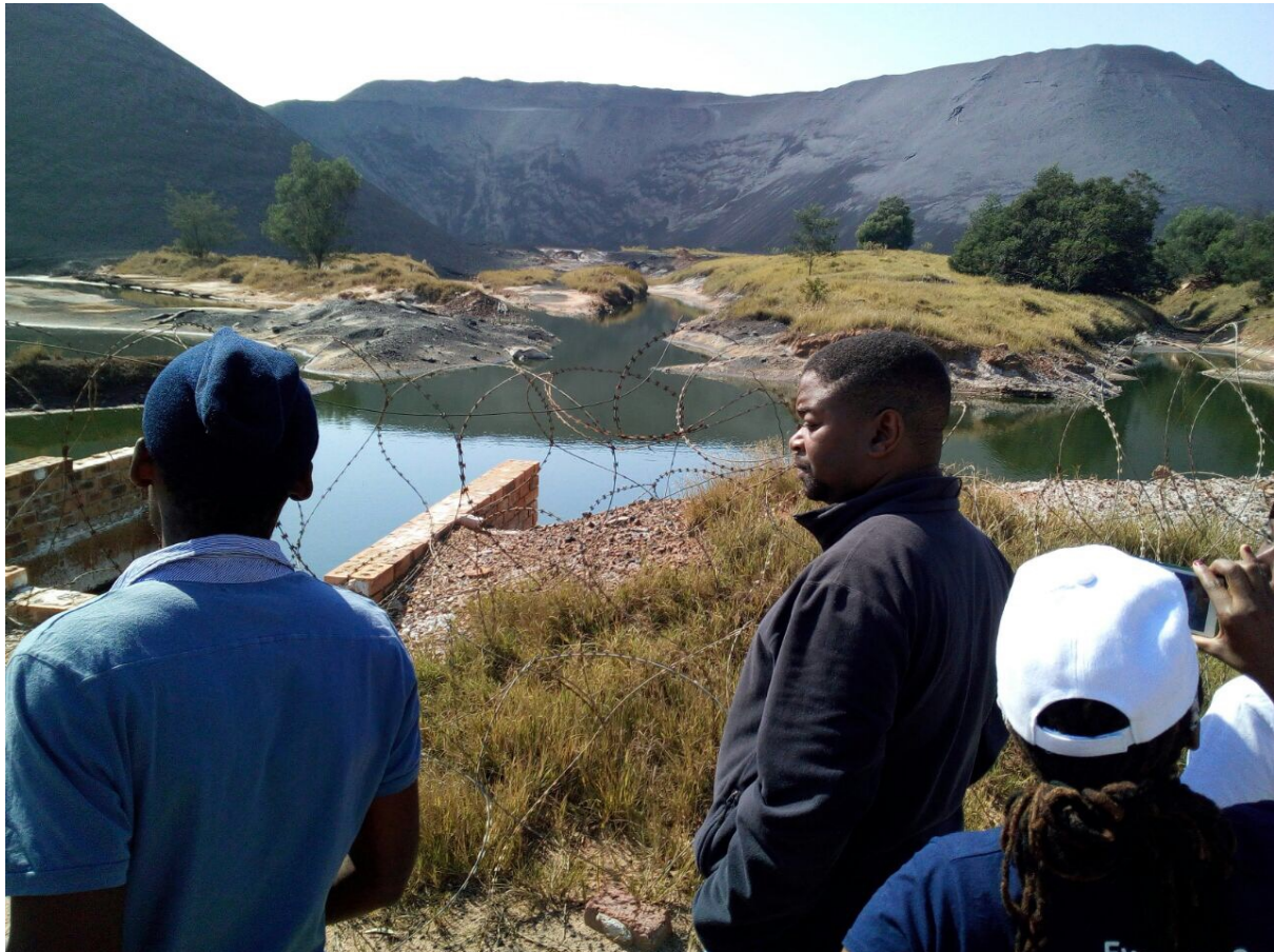
Showing our fellow course participants the mine dump and toxic dams

Telling'. CULISA also collected water and soil samples from the mine dump for testing at the University of Venda. We are working with the Young Water Professionals (YWP) on this but unfortunately have not yet received any definitive test results other than initial results which confirmed that the water we collected was highly acidic.