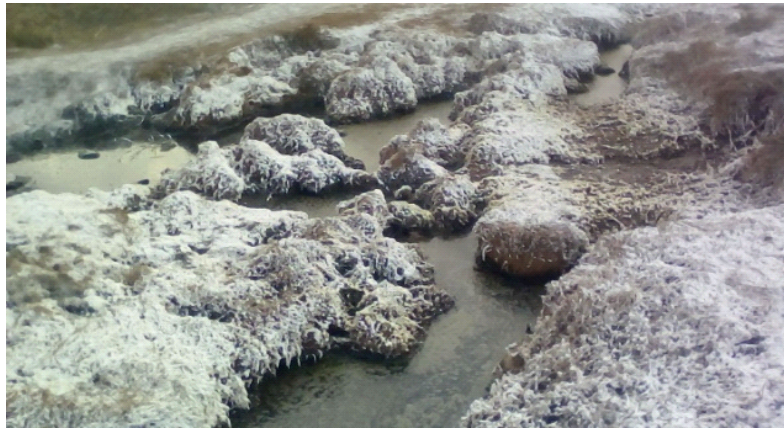
Karlspruit stream surrounded by the white powder

The white powder dominates and covers the top soil changing the soil texture and also the soil colour. When you walk on top of the soil it feels like you could sink. The powder goes through the ground and underground into the Karlspruit.