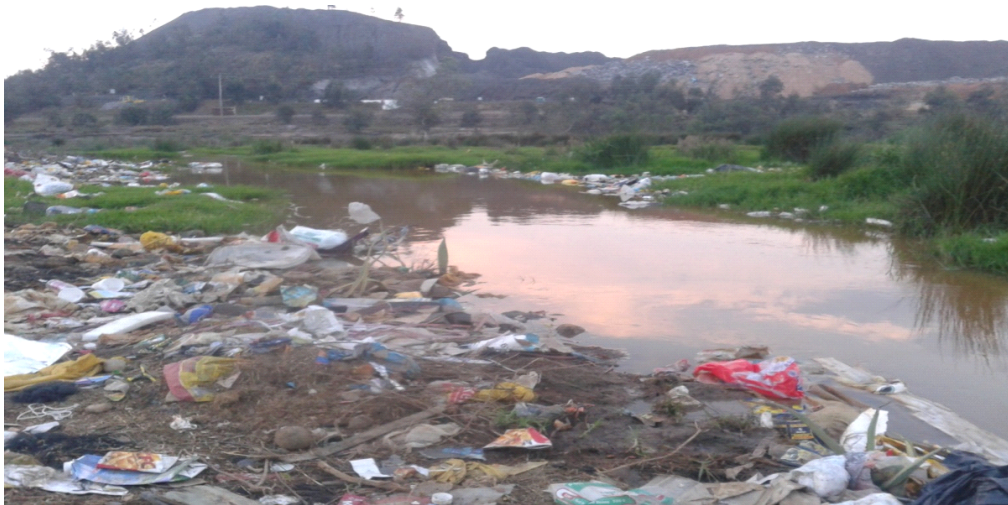
Mine dumps and polluted water, in Vosman. People live 20 metres from this polluted water.