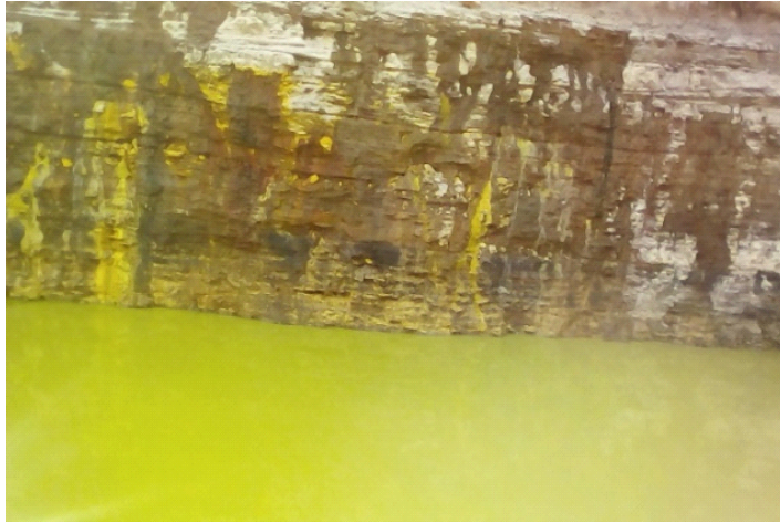
Polluted dam close to the dump.

The dump looks shiny with white powder. The west edge has a terrifying highly polluted waste water dump.