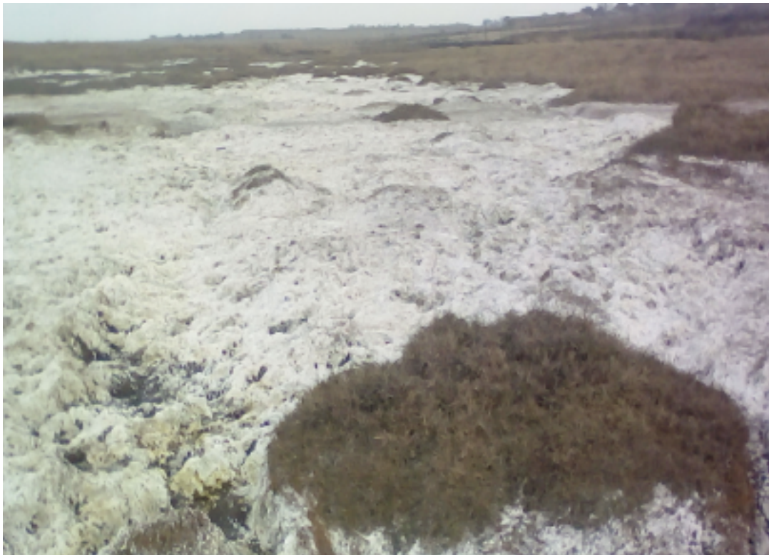
White ice like powder around the dump

We have discovered the freezing zone. When the white powder connects with water its results in a freezing white ice like substance. When you feel the ground under the white powder it is cold.