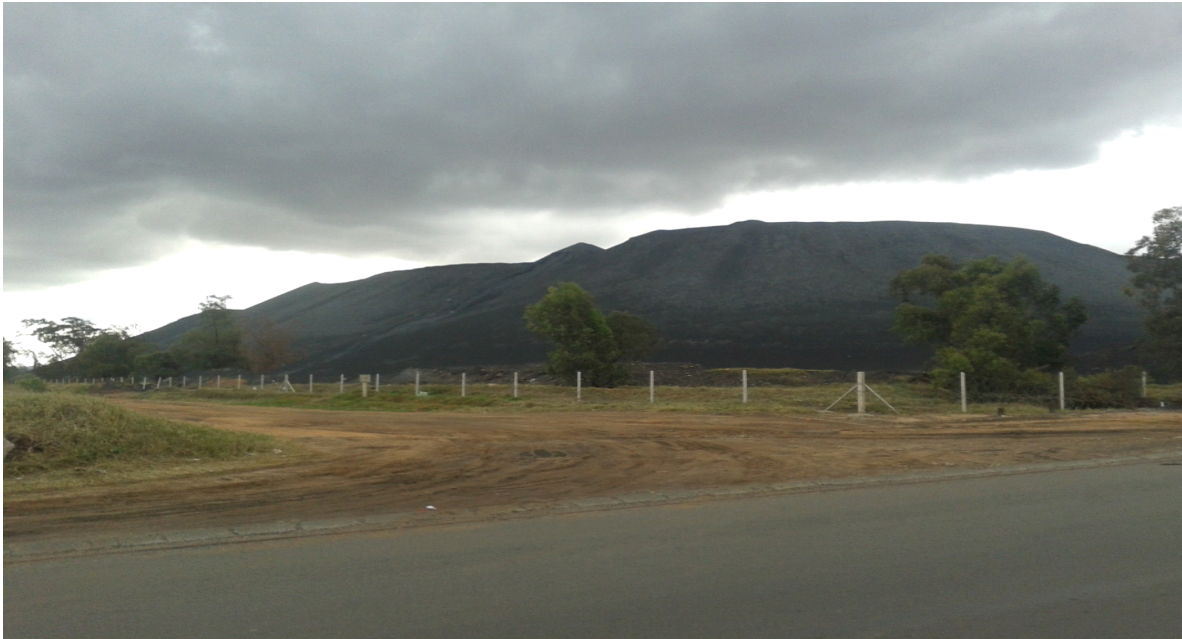
The Highveld Steel Mine Dump

Highveld Steel and Vanadium Corporation currently has a large steel refinery called Vanchem in Emalahleni. At this plant is a giant waste dump with more than 17 million tons of waste material surrounded by sink holes and polluted dams. The dump sits next to the main entrance gate of the Vanadium plant. It looks grey in colour and it's like a huge mountain about 40 meters long with no trees or any other vegetation growing on it. On top of the dump there is a rock formation. It is composed of soft sand like ash particles which travel through wind and water interfering with animals, human life and the entire environment.