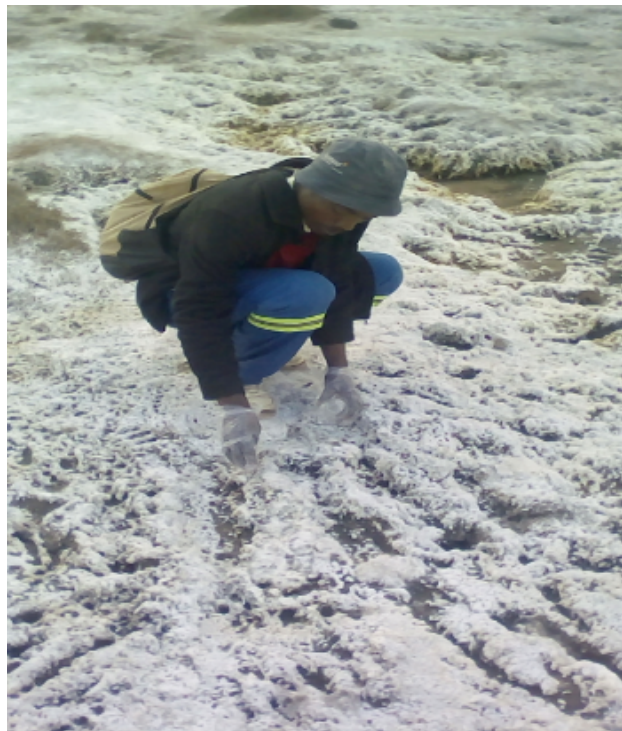
Elvis collecting some of the white powder to send to the University of Venda

These are a lot of questions and each one could make up a change project. We tried to address the questions relating to the toxic materials, the white powder and health impacts. We collected samples of the white powder from the dump as well as samples of soil which we labelled carefully. We sent the samples to the University of Venda but we have yet to receive any results.