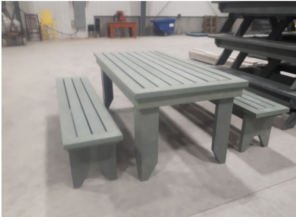
HARVEST TABLE & BENCHES