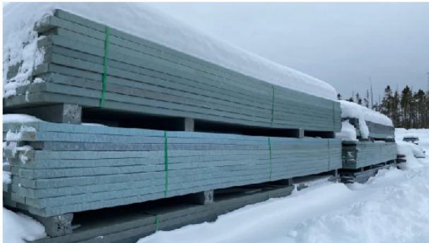
Goodwood Plastic Products Ltd. turns plastics such as shopping bags into plastic lumber.

In the summer of 2019, LakeCity Works partnered with the Halifax Regional Municipality to deliver 50 recycled plastic picnic tables to various parks and beaches throughout the municipality.