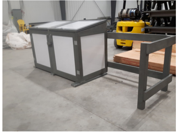
RURAL GARBAGE BIN UNITS