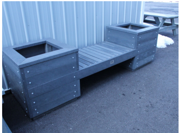
PLANTER SEATING BENCH