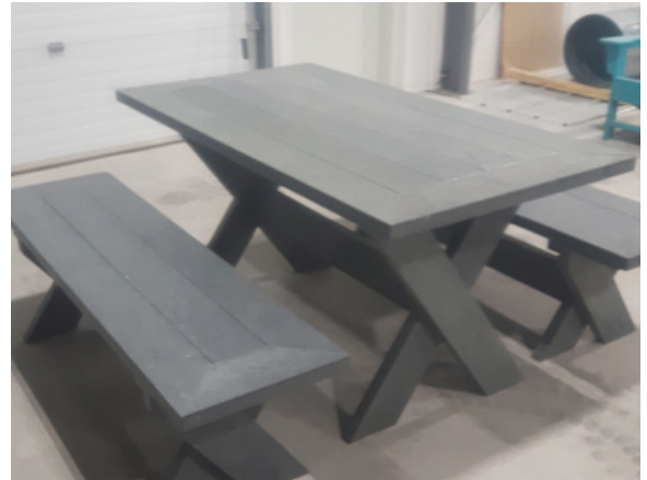
X-FRAME TABLE & BENCHES