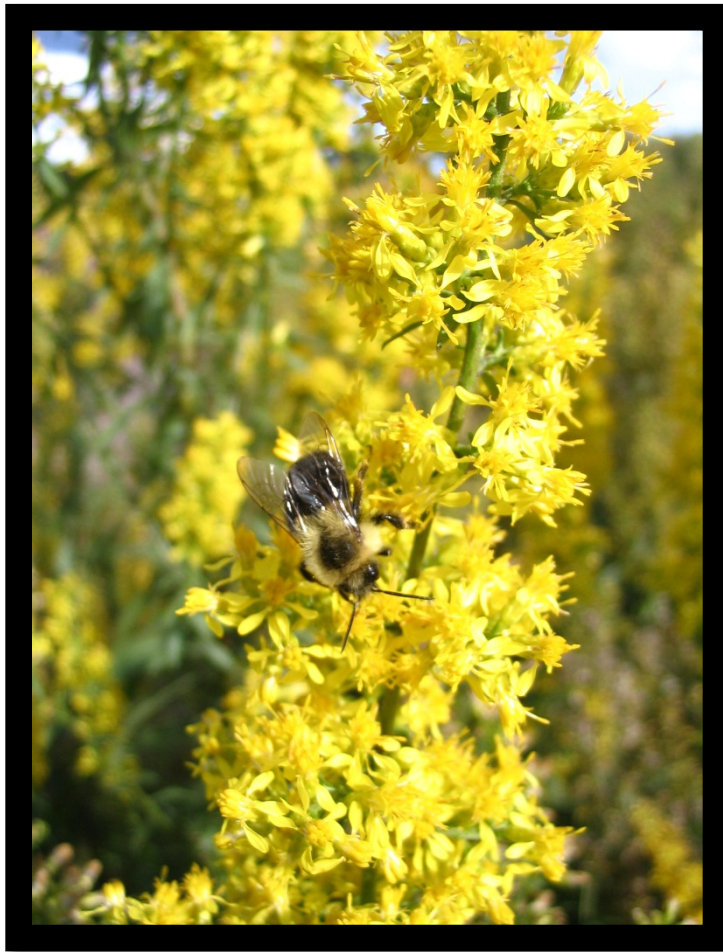
Bumble bee foraging on goldenrod, Solidago sp.