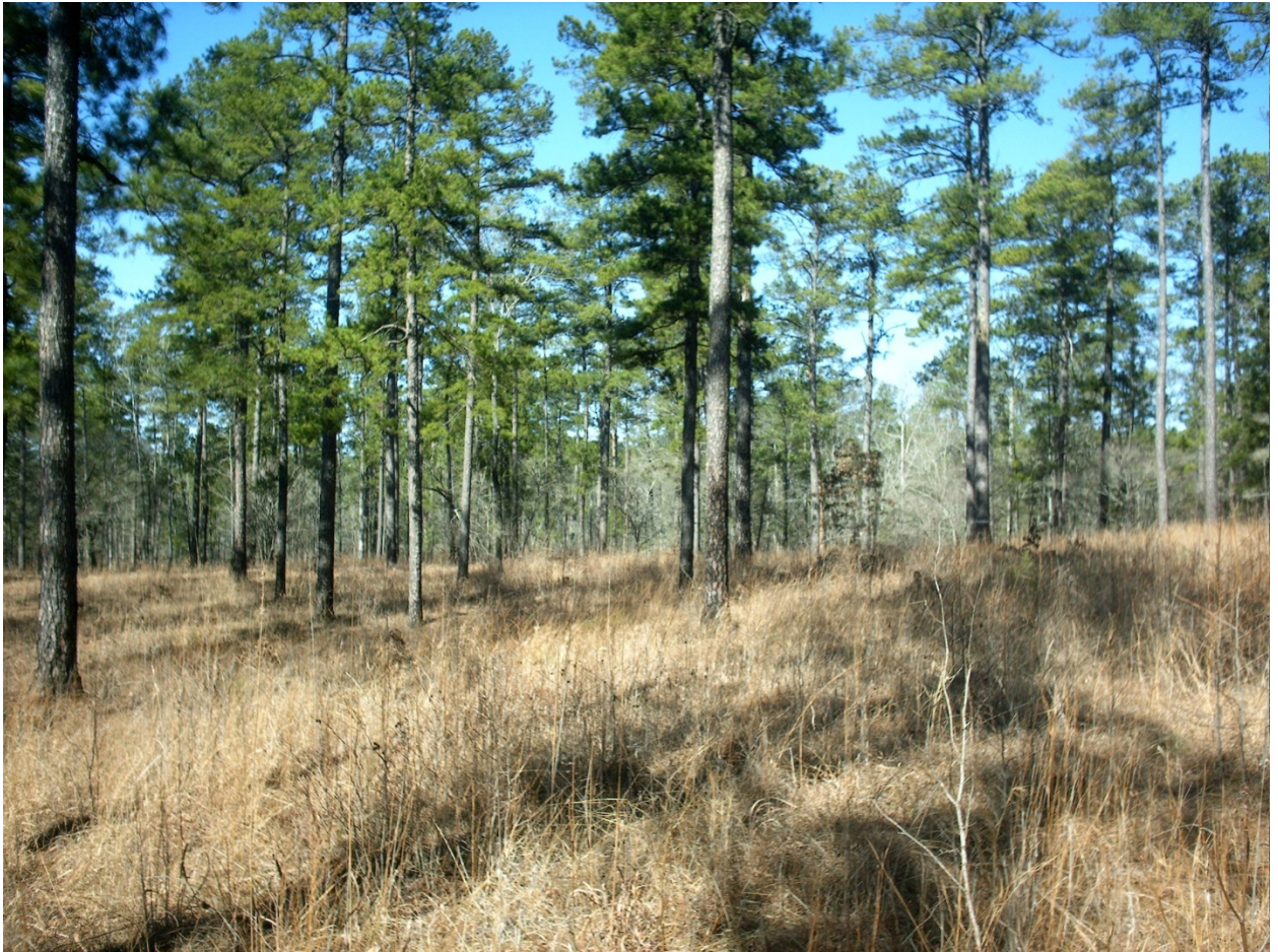
Figure 9. Successful thinning project in a southeastern pine savanna that now provides excellent pollinator habitat.