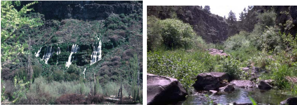
Figure 14. Riparian areas, including those around spring and seeps (left) and those around streams (right), can provide diverse pollinator habitat.