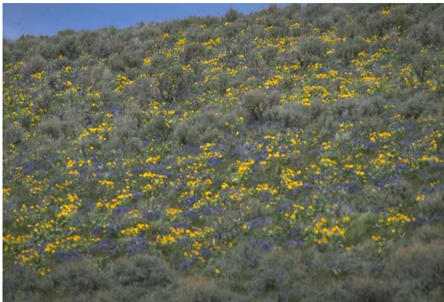
Figure 2. A sagebrush plant community with blooming forbs that provides forage for pollinators.

For additional information on pollination and pollinators, see the on-line material at http://dx.doi.org/10.2111/RANGELANDS-D-11-00008.s.1 . Associated with the June 2011 special issue of Rangelands Volume 33 Number 3 Pollinators in Rangelands.