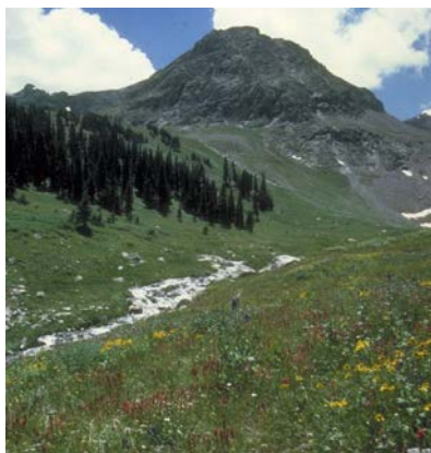
Figure 1. Pollinator habitat in an open landscape with good sun exposure and many different types of flowering forbs.

The best pollinator habitat sites for foraging are open landscapes with good sun exposure and many different types of herbaceous plants. Habitat patches that are bigger, rounder, and closer to other patches are generally better than those that are smaller, uneven in shape, and isolated. Habitats with a variety of native flowering plants that have overlapping blooming times and that are adapted to local soils and climates are usually the best sources of nectar and pollen for pollinators (Black et al, 2007). Some pollinators are limited in the distance from their nesting sites they can forage. For example, no bee is likely to travel more than 1.5 kilometer (about 0.9 mile) from its nesting site, and most are likely to fly distances that are significantly less (Gathmann and Tschardt, 2002). Bumble bees and honey bees, however, provide notable exceptions, easily flying 1 mile in the case of bumble bees and 2–4 miles in the case of honey bees.