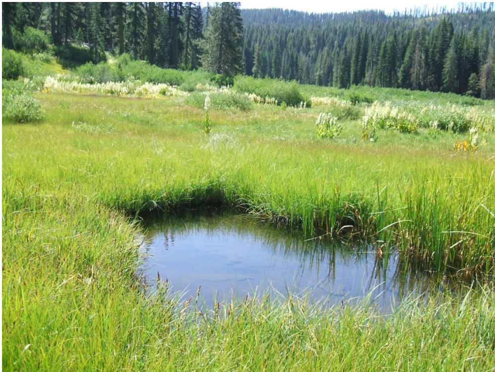
Figure 3. A clean, reliable source of water, like this high-elevation meadow with open water, is essential to pollinators. Running water and ponds provide resources for drinking. Water sources that are shallow or have sloping sides allow for easier approach without drowning.

Site-specific prescriptions are discussed in subsequent sections and should be developed after documentation of environmental effects.