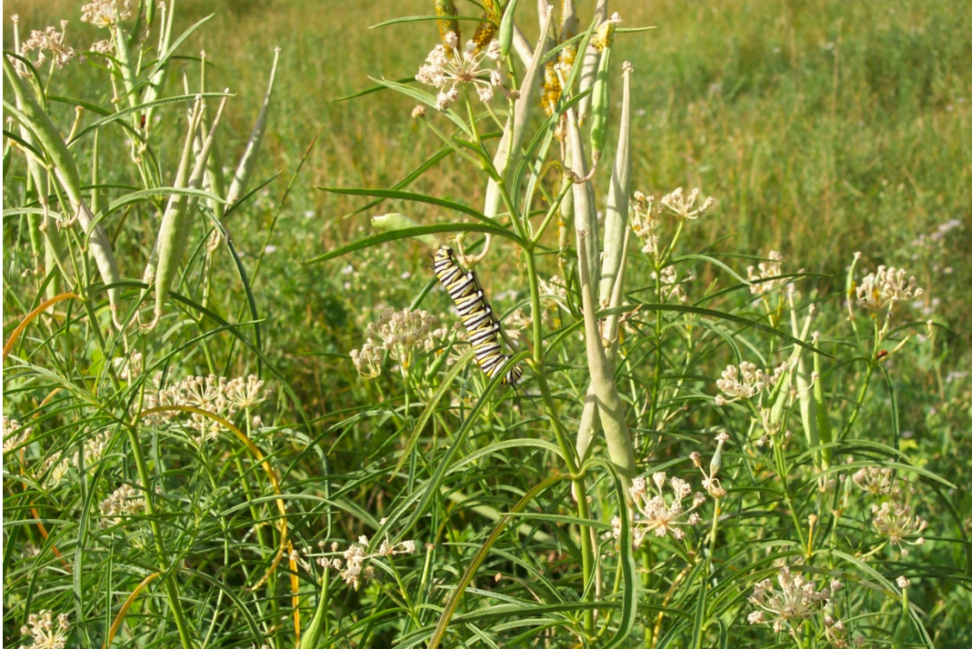
Figure 20. A monarch butterfly caterpillar on flowering narrow leaf milkweed.