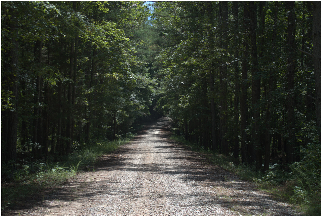
Figure 11. Dense roadside trees and overhanging canopy result in poor pollinator habitat.