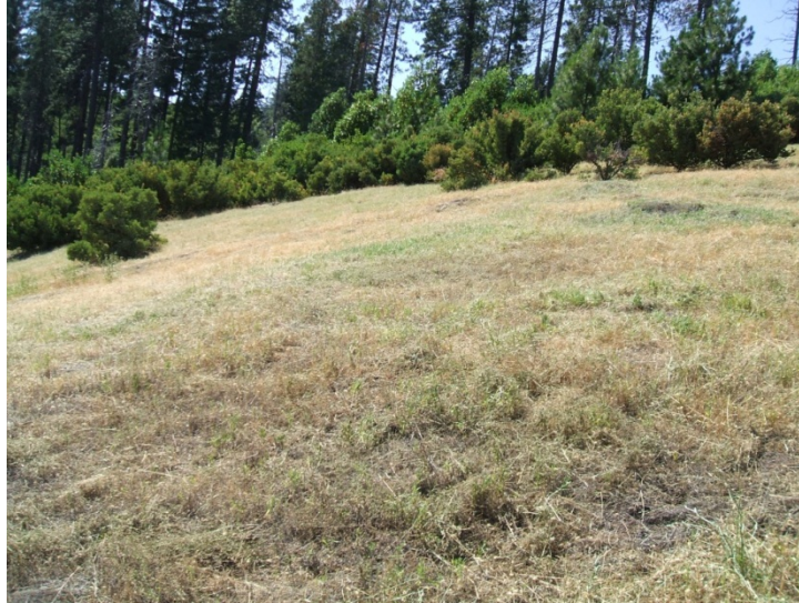
Figure 18. A dry meadow that was mowed for yellow star thistle control.