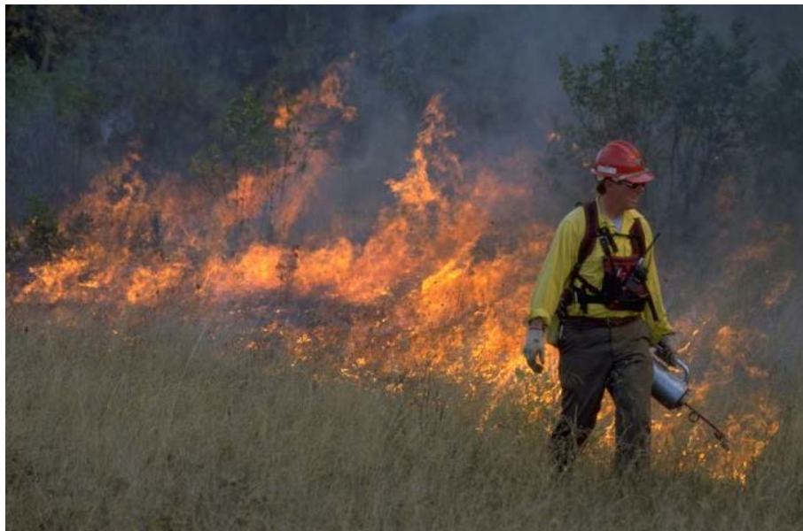
Figure 16. Many pollinators can survive infrequent, low intensity prescribed burns which promote long term maintenance of pollinator habitat.