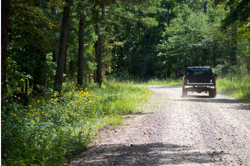
Figure 12. Roadside management results in canopy openings for good pollinator habitat.