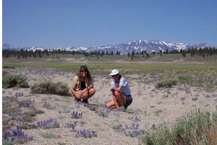
Figure 7. Botanists near Bishop, California, determine if a population of lupine is ready for seed collection.