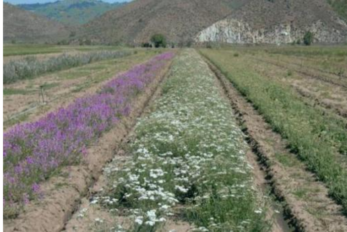
Figure 8. A native seed production field.