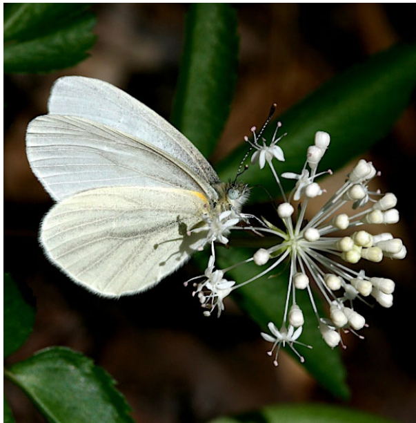
Figure 6. A West Virginia White butterfly laying eggs on nonnative garlic mustard. Toxins in garlic mustard can kill the larvae when they hatch.