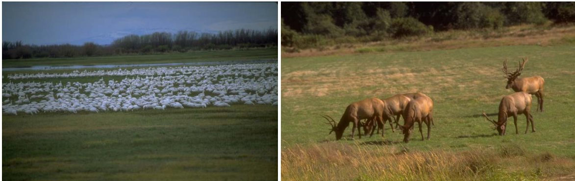
Figure 19. Abundant wildlife including snow geese (left) and elk (right) rely on public lands for habitat, as do pollinators.