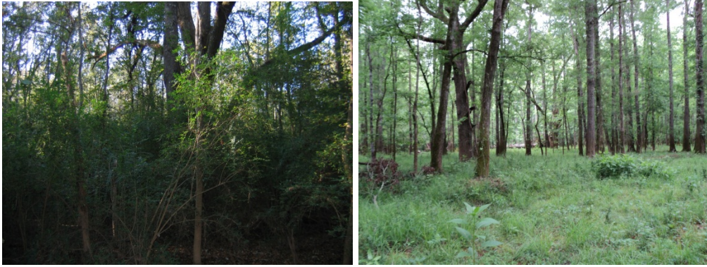
Figure 10. Poor pollinator habitat invaded by an understory shrub (left) and good pollinator habitat providing open areas for forbs and small shrubs to bloom. (right).