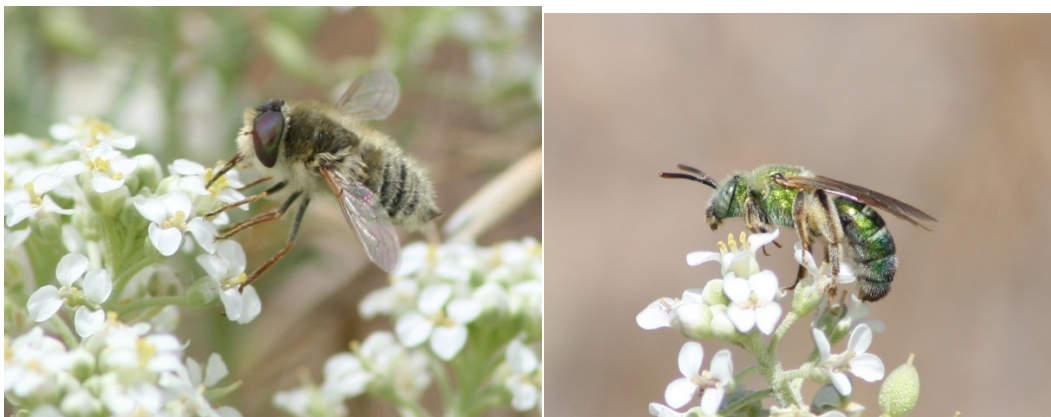
Figure 5. A bee fly (left) and a sweat bee (right) pollinating slickspot peppergrass, a rare listed plant species from Idaho. Flowers of this species that are insect pollinated produce more seed than those that are self-pollinated.