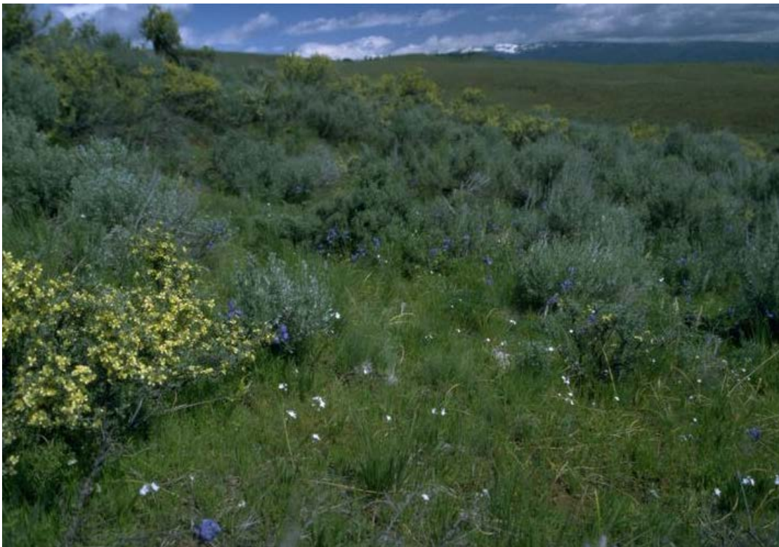
Figure 15. Wildlife opening in sagebrush habitat with structure and diversity that can benefit pollinators.