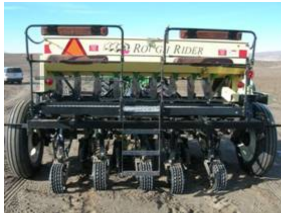
Figure 13. A minimum till drill.