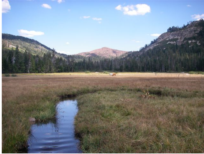
Figure 17. Cattle grazing in a meadow with pollinator habitat.