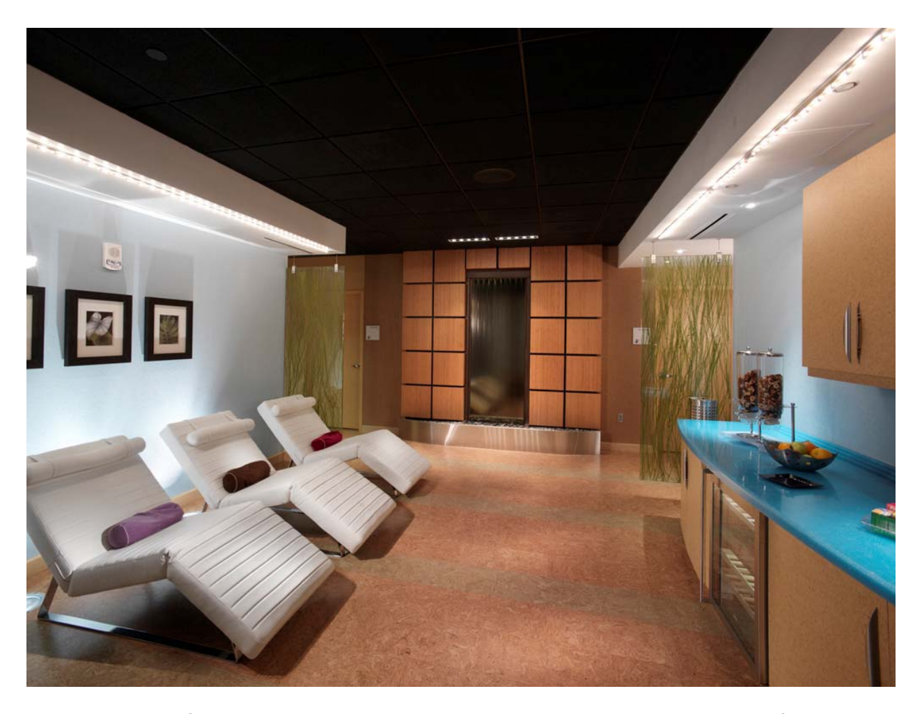
The use of sustainable and recycled material throughout the project interior finishes.

Project Highlights: CHRISTUS Good Shepherd Institute for Healthy Living and the Longview Community will benefit from special design enhancements drawn from (5) broad categories of sustainability (Site, Energy, Water, Products and Air Quality) as they apply to the overall design construction and operations. These benefits will include savings in long term operational expenses, reduced consumption of energy and natural resources, increased consumption of recycled or renewable resources, reduced landfill volumes, and many improved environmental health factors.