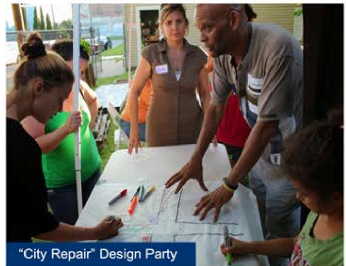
"City Repair" Design Party