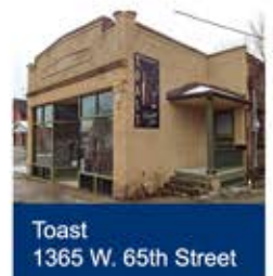
Toast 1365 W. 65th Street