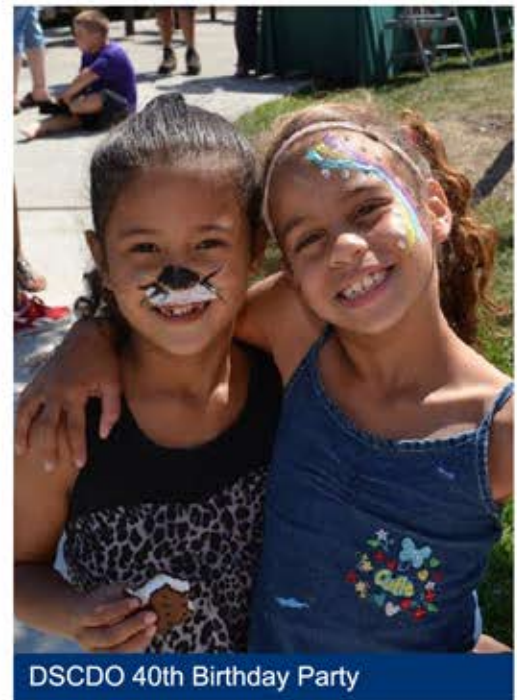
DSCDO 40th Birthday Party