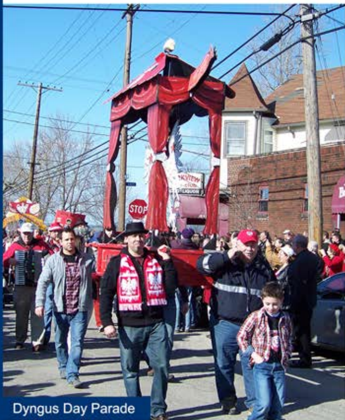
Dyngus Day Parade