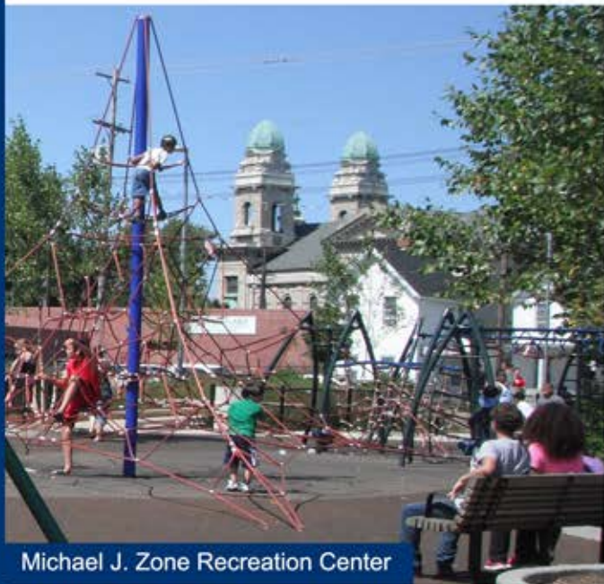
Michael J. Zone Recreation Center