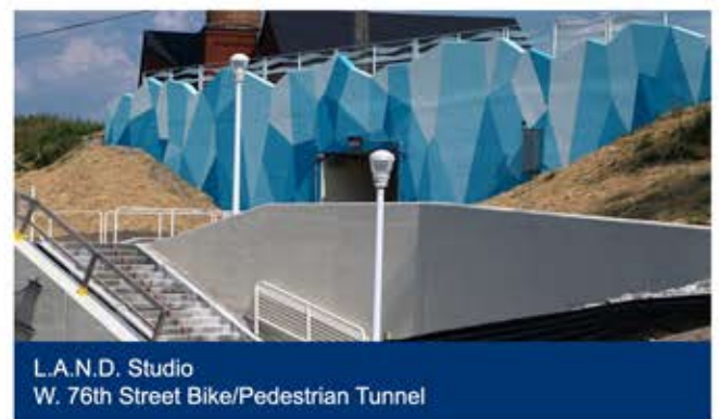
L.A.N.D. Studio W. 76th Street Bike/Pedestrian Tunnel