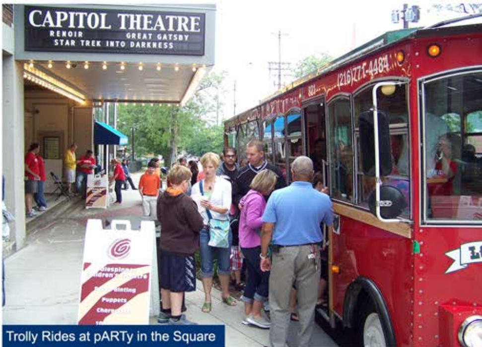
Trolley Rides at pARTy in the Square