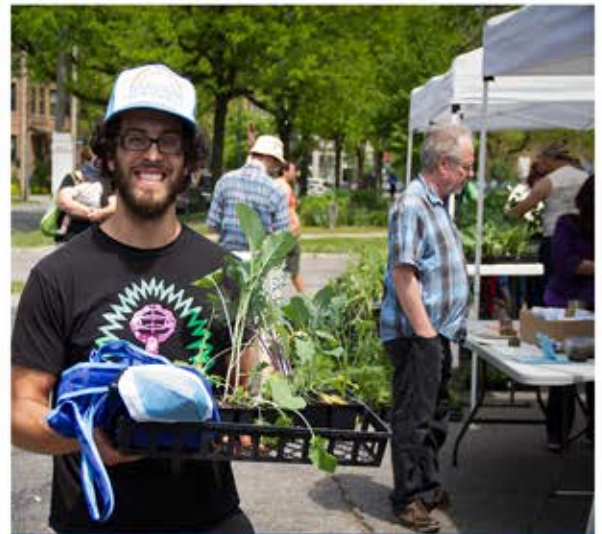
Gordon Square Farmer's Market Plant Sale