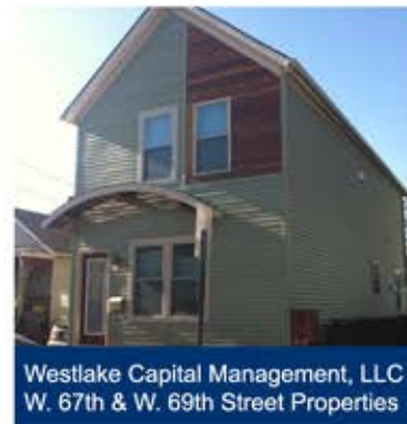
Westlake Capital Management, LLC W. 67th & W. 69th Street Properties