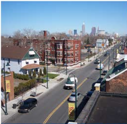
Cleveland Skyline from Gordon Square