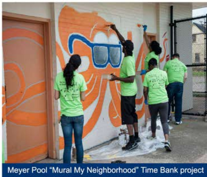
Meyer Pool "Mural My Neighborhood" Time Bank project