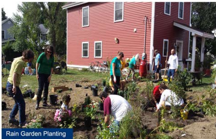
Rain Garden Planting