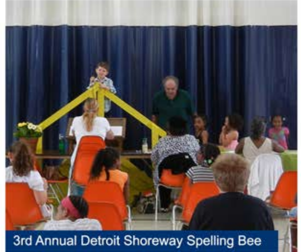
3rd Annual Detroit Shoreway Spelling Bee