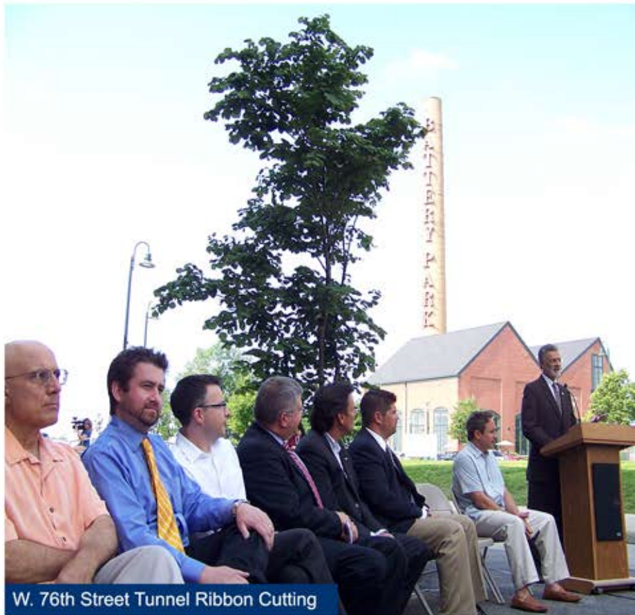
W. 76th Street Tunnel Ribbon Cutting