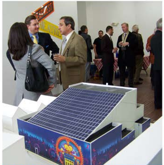
Near West Theatre Groundbreaking Reception