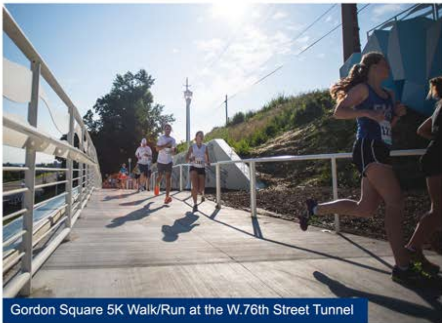
Gordon Square 5K Walk/Run at the W.76th Street Tunnel