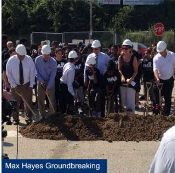
Max Hayes Groundbreaking

SCFBC Economic Development staff welcomed 9 new businesses including; Melissa Child Care Center, Benny's Sports Café, Elk & Elk, Goldie's Plaza, Express Laundromat, Las Dos Fronteras, Martin Hair Salon, Bebos Computers, and Fish Shack and Grill to the community in 2013. Under staff guidance, 2 Storefront Renovation Projects were completed, 4 more Storefront Renovation projects were began, 4 businesses were referred to Near West Design review process, and an additional 30 businesses were referred to the City of Cleveland $5,000 50/50 small business storefront improvement grant matching program. Additionally, SCFBC testified 107 times before the Cleveland City Planning Commission and Board of Zoning Appeals.