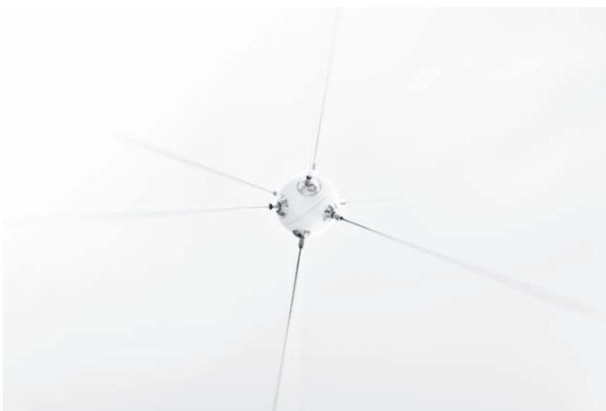
detail of FLY , commissioned by Rachel Verghis / Incubator

special thanks to Heloise Reynolds / photography by nat urazmetova , some/things agency