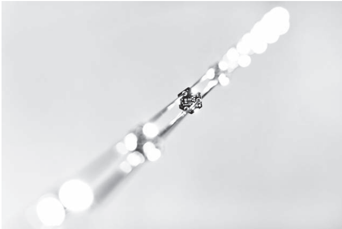
detail of FUTURE SELF [work in progress], commissioned by MADE Berlin