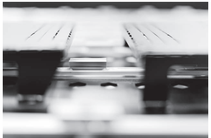
detail of FUTURE SELF [work in progress], commissioned by MADE Berlin