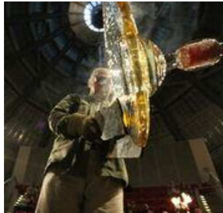
Albert Paley at Museum of Glass Hot Shop