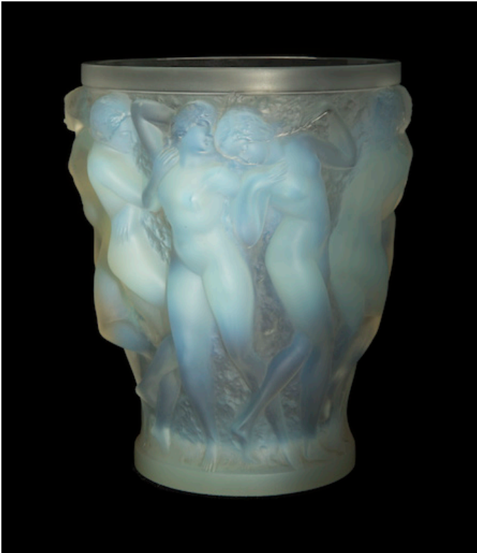
René Lalique (French, 1860-1945). Vase Bacchantes (Bacchantes Vase) , 1927.