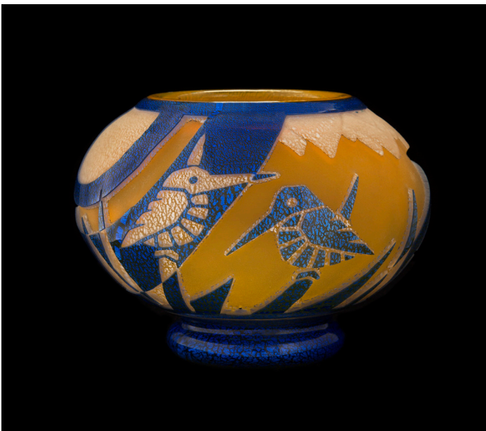
Muller Frères (French, founded 1895-closed 1936). Vase with bird design, circa 1925-1929.