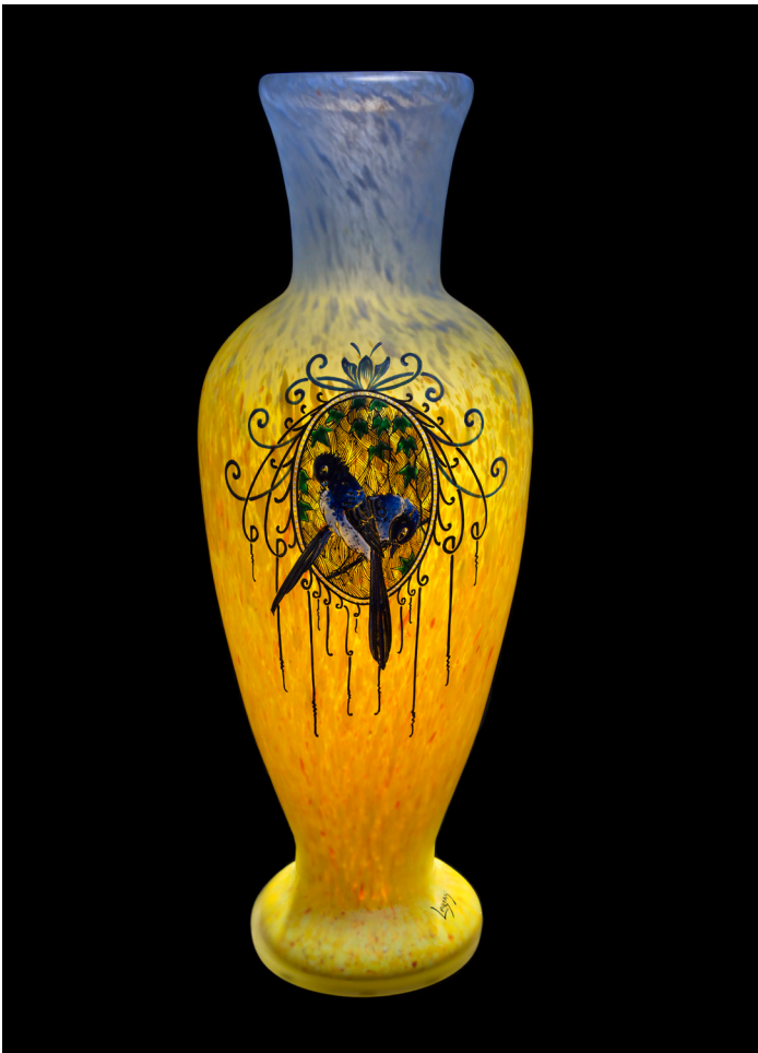
Legras & Cie (French, founded 1864-closed 1930). Vase with bird design, circa 1925-1929.