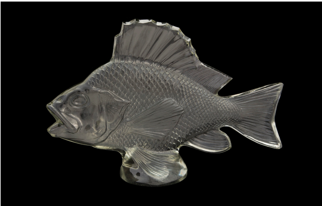
René Lalique (French, 1860-1945). Gros Poissons, Algues ( Large Fish, Algae ), 1922.