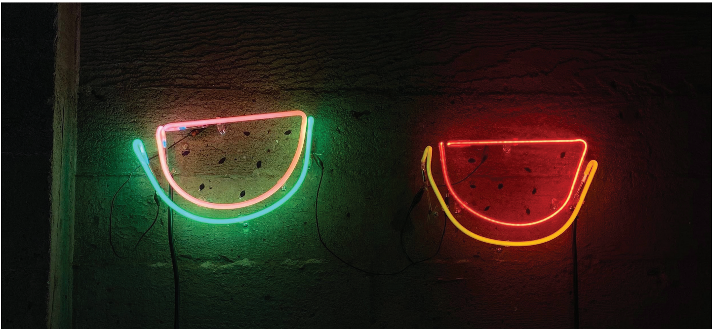
Jude Abu Zaineh (Palestinian-Canadian, born 1990). tend to grow (watermelons) , detail, 2022. Varying glass tubes and gases, electrodes; Dimensions variable.

Exhibition features artists of historically under-represented communities in the neon art form and the women who taught them.