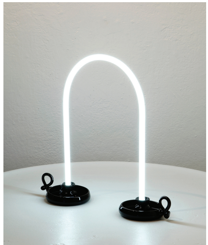
Victoria Ahmadizadeh Melendez (American, born 1988). a quiet life, a couple of times over , 2021. Blown glass, argon, and mercury; 14 x 14 x 5 in. Courtesy of the artist. Photo by Matthew Hollerbush.