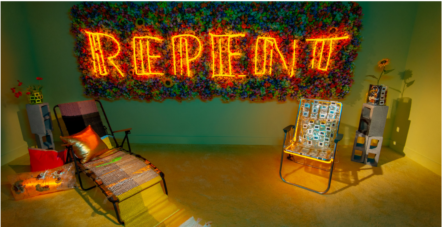
Meryl Pataky (American, born 1983) with textile collaboration by Allie Felton. A Modern Guilt (installation view), 2020. Neon and mixed media; dimensions variable.