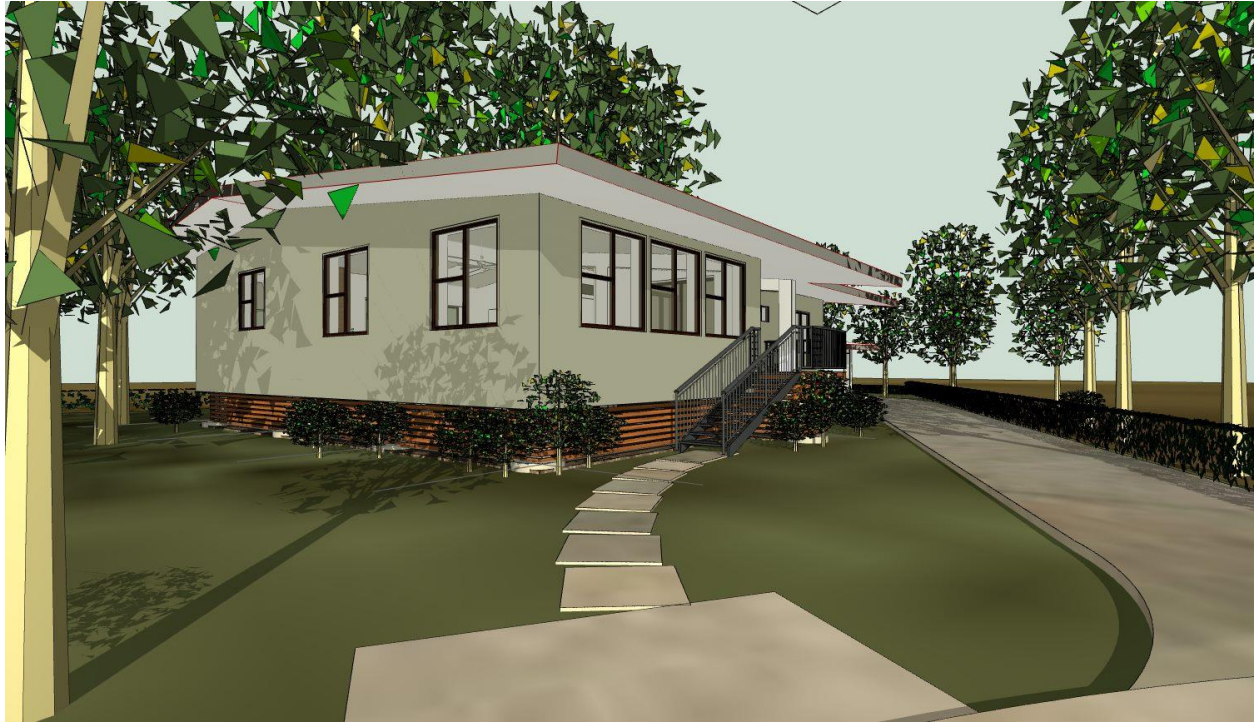
Mid Century Modern Style