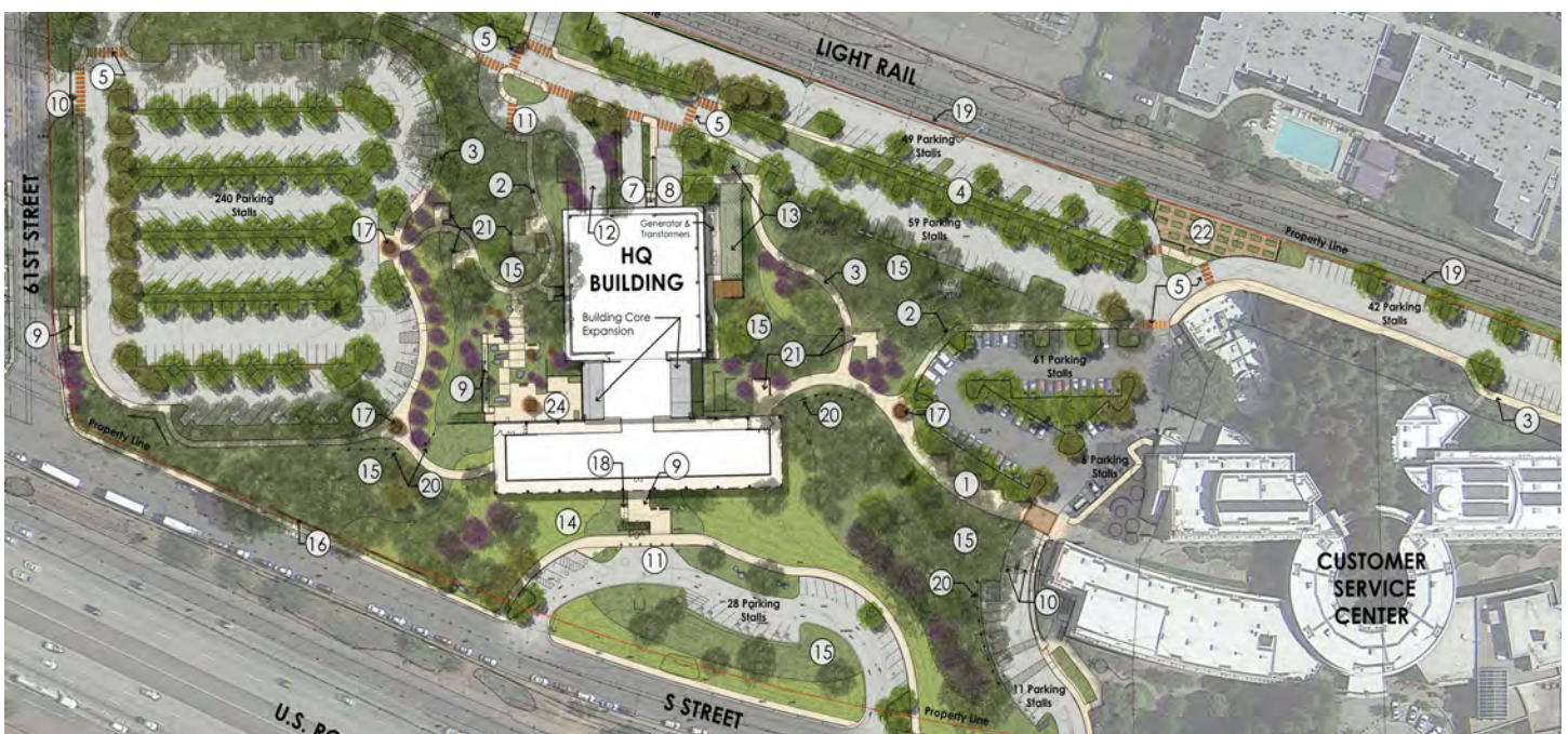
2020 SIERRA CHAPTER HONOR AWARD, GENERAL DESIGN: SMUD HEADQUARTERS HISTORIC SITE RENOVATION BY CALA

The jury process is "blind." In other words, the identities of the entrant and creative team are not revealed to the jury. An awards jury consisting of ASLA members from an out of state chapter will be selected to review and judge all submittals. Members of the Awards Jury, as well as the firms, organizations, or agencies they represent are not eligible to enter the Awards Program. The Sierra Chapter ASLA retains the right to disqualify any entry that does not meet the program requirements or that presents a conflict of interest. In such cases, refunds will be issued.