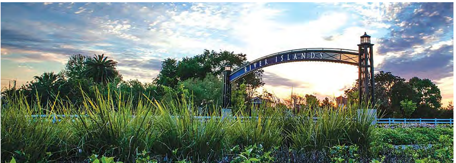
2020 SIERRA CHAPTER MERIT AWARD, RESIDENTIAL MULTI-FAM: RIVER ISLANDS DEVELOPMENT BY O'DELL ENGINEERING

Please list all project credits on the Concealed Identification and Credit Form (to be provided in your Dropbox folder). This must be filled out entirely and uploaded to your Dropbox as part of your submittal.