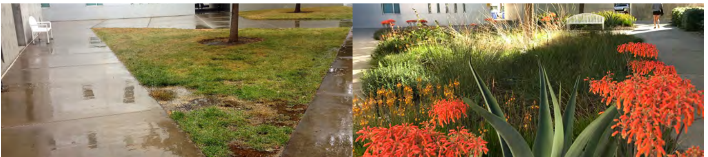
2020 SIERRA CHAPTER MERIT AWARD, RESEARCH/ANALYSIS... TACTICAL GREEN INFRASTRUCTURE BY URBAN RAIN DESIGN

Recognition: The Awards Jury may select one Honor Award and any number of Merit Awards in this category.