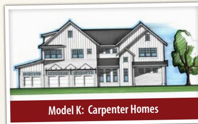
Model K: Carpenter Homes