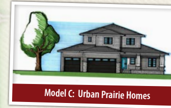
Model C: Urban Prairie Homes