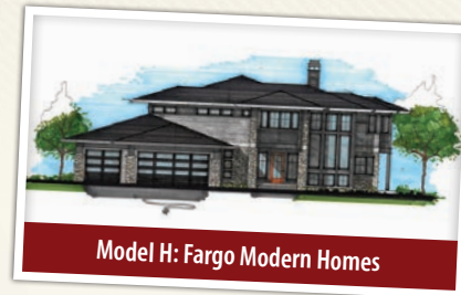
Model H: Fargo Modern Homes