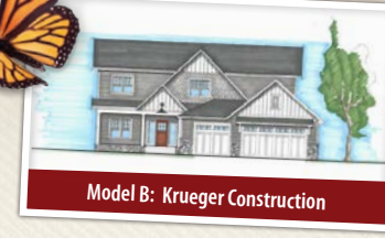
Model B: Krueger Construction