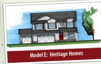
Model E: Heritage Homes