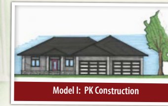
Model I: PK Construction