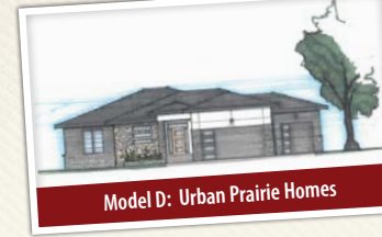
Model D: Urban Prairie Homes