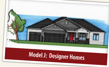
Model J: Designer Homes