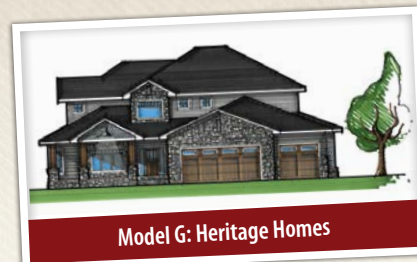
Model G: Heritage Homes