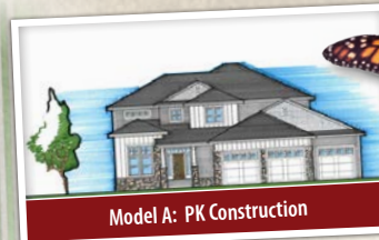
Model A: PK Construction

Future phases are subject to change without further notice.