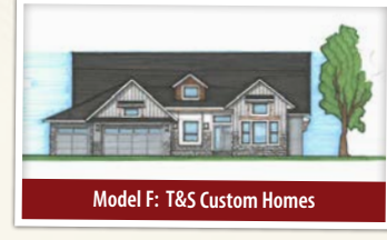
Model F: T&S Custom Homes