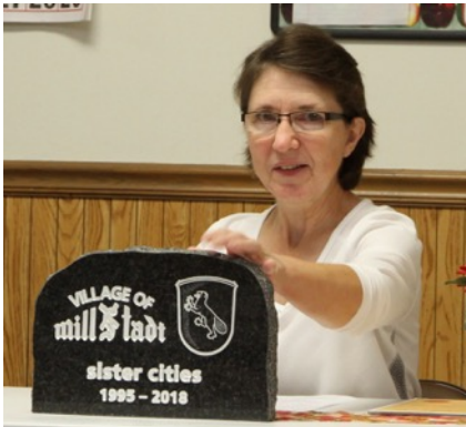
"Friendship" stone and Certificate from Gross-Bieberau