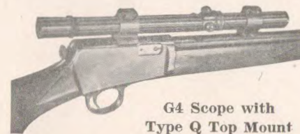
G4 Scope with Type Q Top Mount

Rifles marked * require altering of bolt handle except with J Scopes when mounted forward.