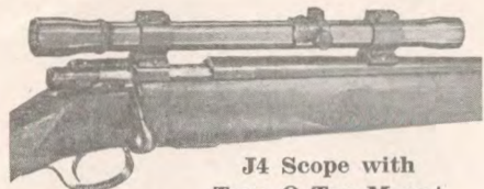
J4 Scope with Type Q Top Mount

Q Top and Q Side ( \frac{3}{4} " dia.) Mounts are like the Type U (1" dia.) Mounts which have proved so dependable with the Model K Scopes. The Q Mounts are machined from solid metal and because of one-piece construction, there are no parts to loosen or wear. Mount rigidity is extremely important, since even the slightest movement between parts of mount, scope and mount, or mount and gun may throw the scope far out of alignment. To make sure your rifle shoots where you aim, use a Weaver Mount.