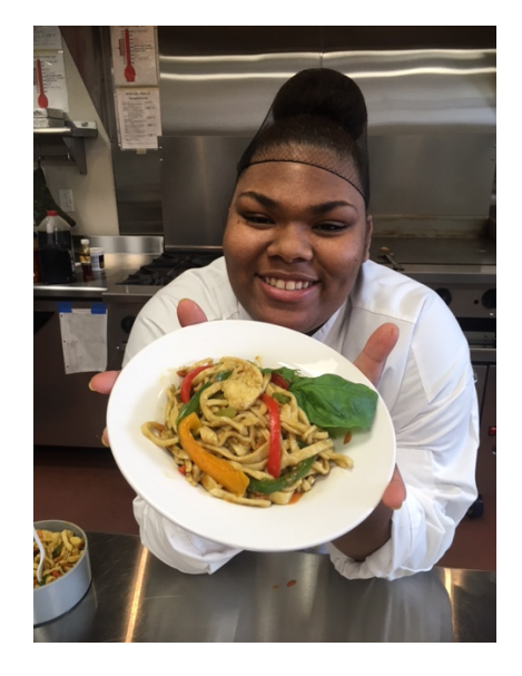
Grow Produce & Use in Culinary Class