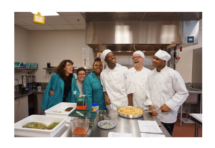
Farm To Table Food Sustainability