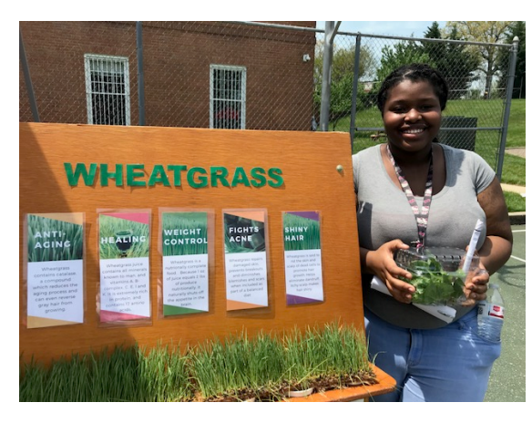
Health & Wellness: Students