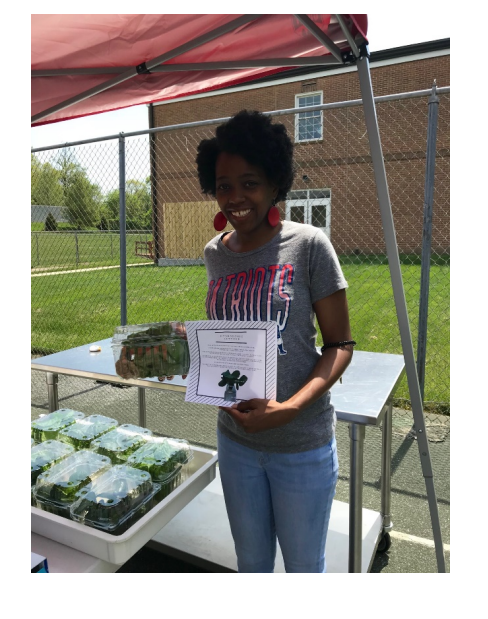
Health & Wellness: Staff