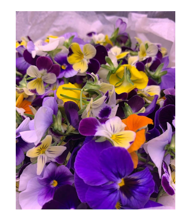
Sell Produce to Local Restaurants