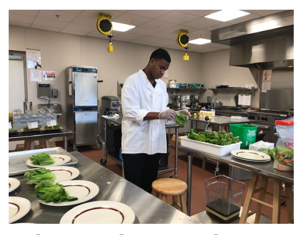
Snip, Snap, Sauté In House & Community Lunches