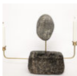
Amber Renaye Answers 5 Questions 1/14/19