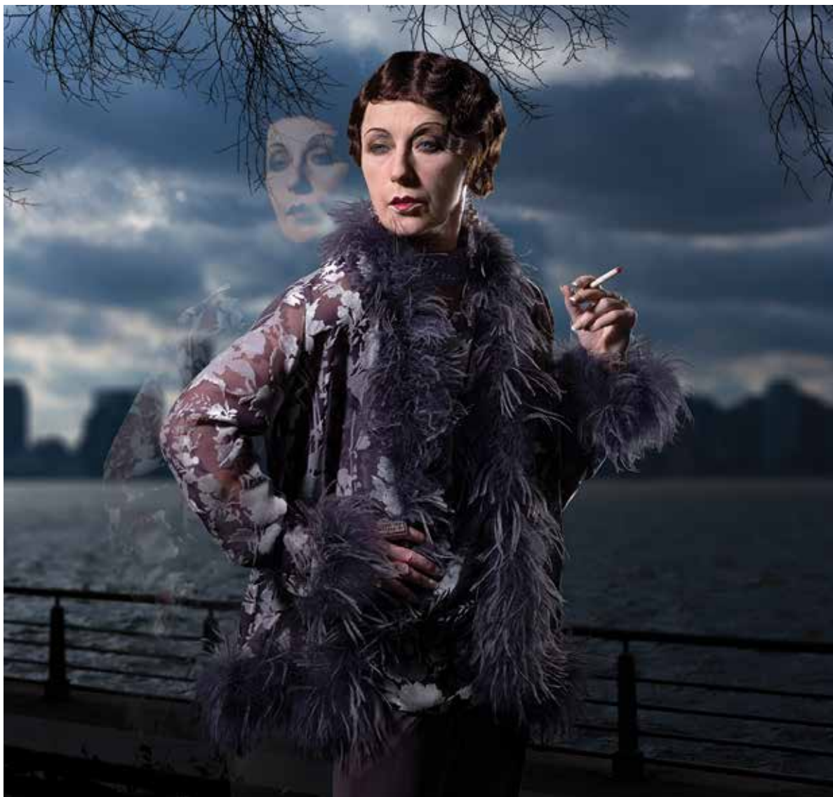
CINDY SHERMAN Untitled #566 , 2016, dye sublimation metal print, 48 x 50.5 inches; 121.9 x 128.3 cm.

Today, as we confront the alt-right conservatism ushered in by Donald Trump’s presidency, and his administration’s hostility to women’s and minority rights, these artists enthusiastically grab the torch that has passed down through 170 years of women’s struggle for equal rights.