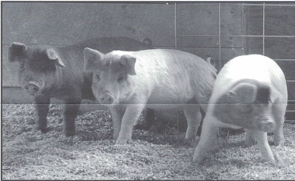
Two-month old pigs in the East Mountain barn. Pigs are weaned at 6 weeks and move to the woods a few weeks later.