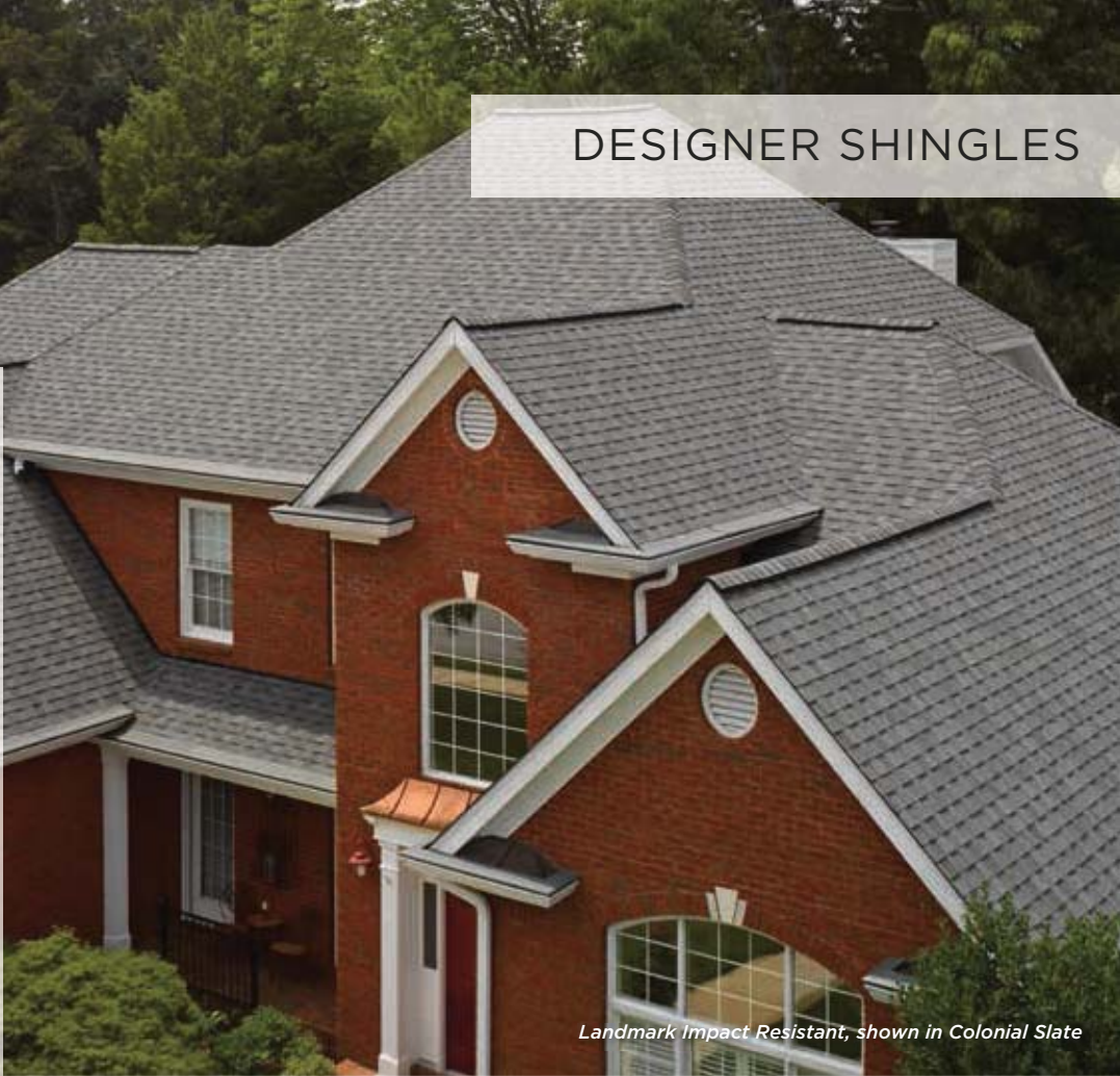
Landmark Impact Resistant, shown in Colonial Slate