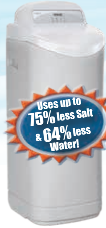
Novo 485 Cabinet Softener

* Water Quality Research Foundation Studies (2010 Detergent savings study, 2009 Energy Savings Study)