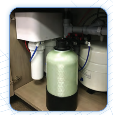
25020189 Kit, Tank, Recirculation, H.E.R.O.™

Applied when the H.E.R.O.™ is installed under a kitchen sink or in a slab home without a basement. This tank provides blending of the HERO recirculated water and helps keep the system operating at its peak performance.