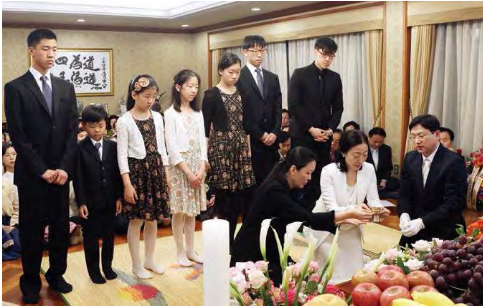
An offering being made during the memorial service

To account properly, adequately, for the depth of heart and mind that characterized each one of these precious True Children would be an impossible task. However, I do hope I am able to help you understand, even in some small way, the agonizing path that all True Family members have followed and continue to follow up until this day.