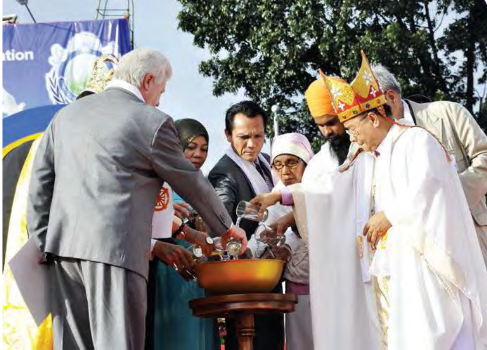
Religious leaders pour water into a common container to symbolize harmony

That is why True Parents are dedicated to the restoration of human families through the marriage blessing, centered on the love of our Heavenly Parent. Whereas man and woman departed from God's original ideal, through the marriage blessing men and women are reconnected, as couples, to God's direct lineage.