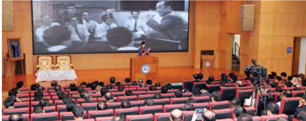
The Opening Session of Vision 2020 Strategy Conference for Strategic and Providential Nations