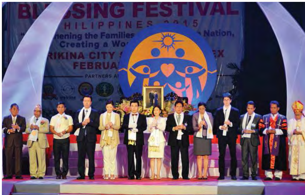
Religious leaders pray for the couples

Today's Blessing Ceremony culminates with True Parents' benediction and blessing. Their sincere prayer is that each couple unites in complete love and harmony with God, our Heavenly Parent. It is their hope that on the foundation of this holy union you may be blessed with devoted sons and daughters that radiate love and virtue toward all living beings on earth. In the loving union of a husband and wife, human beings most closely resemble God's own loving nature. As we each create families of such true love, we help usher in a world of infinite joy and peace, a world in which God can freely dwell.