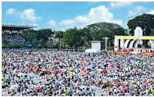
A view of the Interfaith Peace Blessing Festival 2015 at the Marikina Sports Center in the Philippines

ideal and purpose of today's Blessing Ceremony.