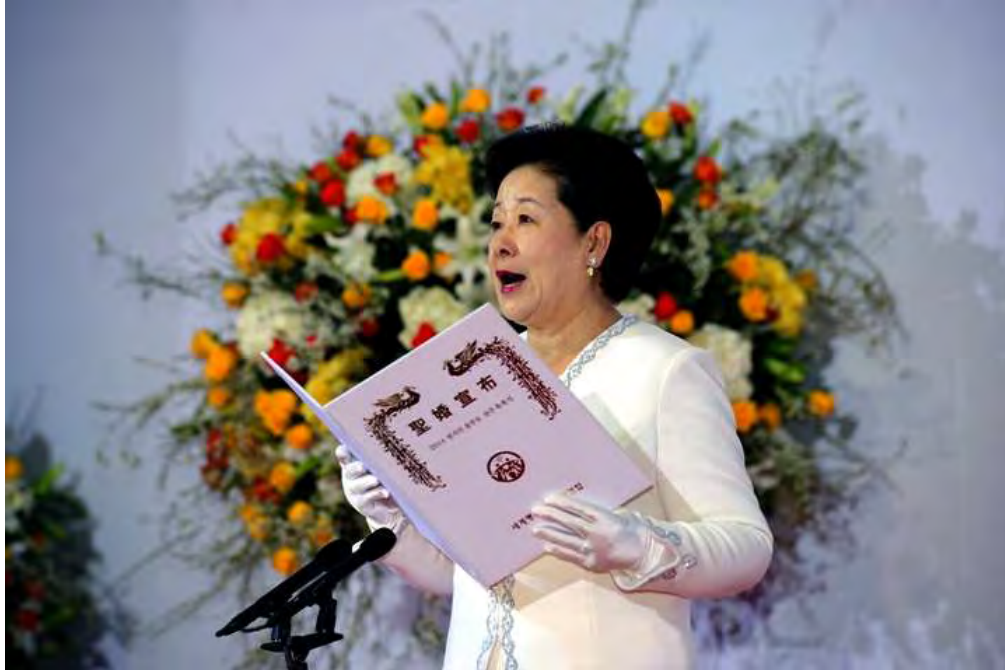
Hak Ja Han February 12, 2014

Hak Ja Han April 22, 2014 Delivered by Sun Jin Moon UPF International Leadership Conference Montevideo, Uruguay