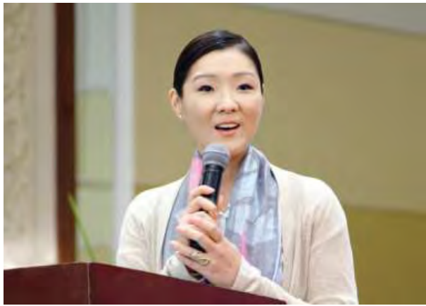
Sun Jin Moon speaking at the celebration following the Peace Blessing Festival in the Philippines

To members the day after the February 1 Peace Blessing Festival in the Philippines