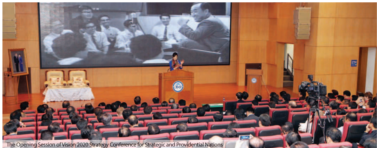
The Opening Session of Vision 2020 Strategy Conference for Strategic and Providential Nations

This unity is what she devoted her whole life to. We can't even imagine. Can you imagine what it's been like to be True Mother, serving True Father, together indemnifying all of history's fallen past to come to a point where they can stand united and liberate the fallen world through their sacrifice? So everything we are, everything we've done, comes from that unity. Without man and woman becoming one in complete harmony, there is no way for us to become children of True Parents. Every blessing we have, calling ourselves a true family, a blessed family, everything with "family," the Family Federation for World Peace and Unification... Where does family start? It started with True Parents, and that is the most important, precious reality. This is something she wanted to make sure was passed on to those in the second and third generations. Because many within our community, my family too, have not been able to realize the significance of what it means to have Heavenly Parent and True Parents as our parents. We have not realized how much they still sacri-