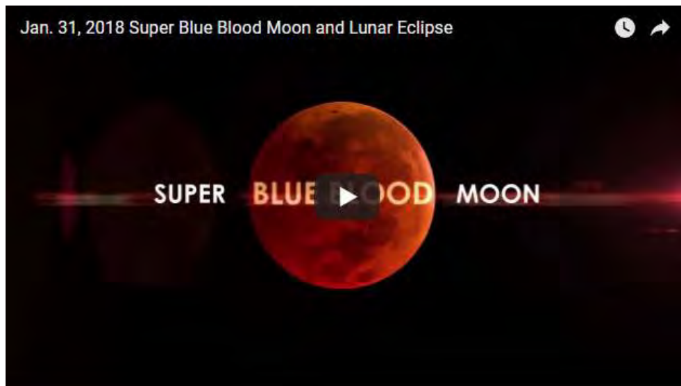
"Super Blue Moon Lunar Eclipse" (3'45) (no-narration video)