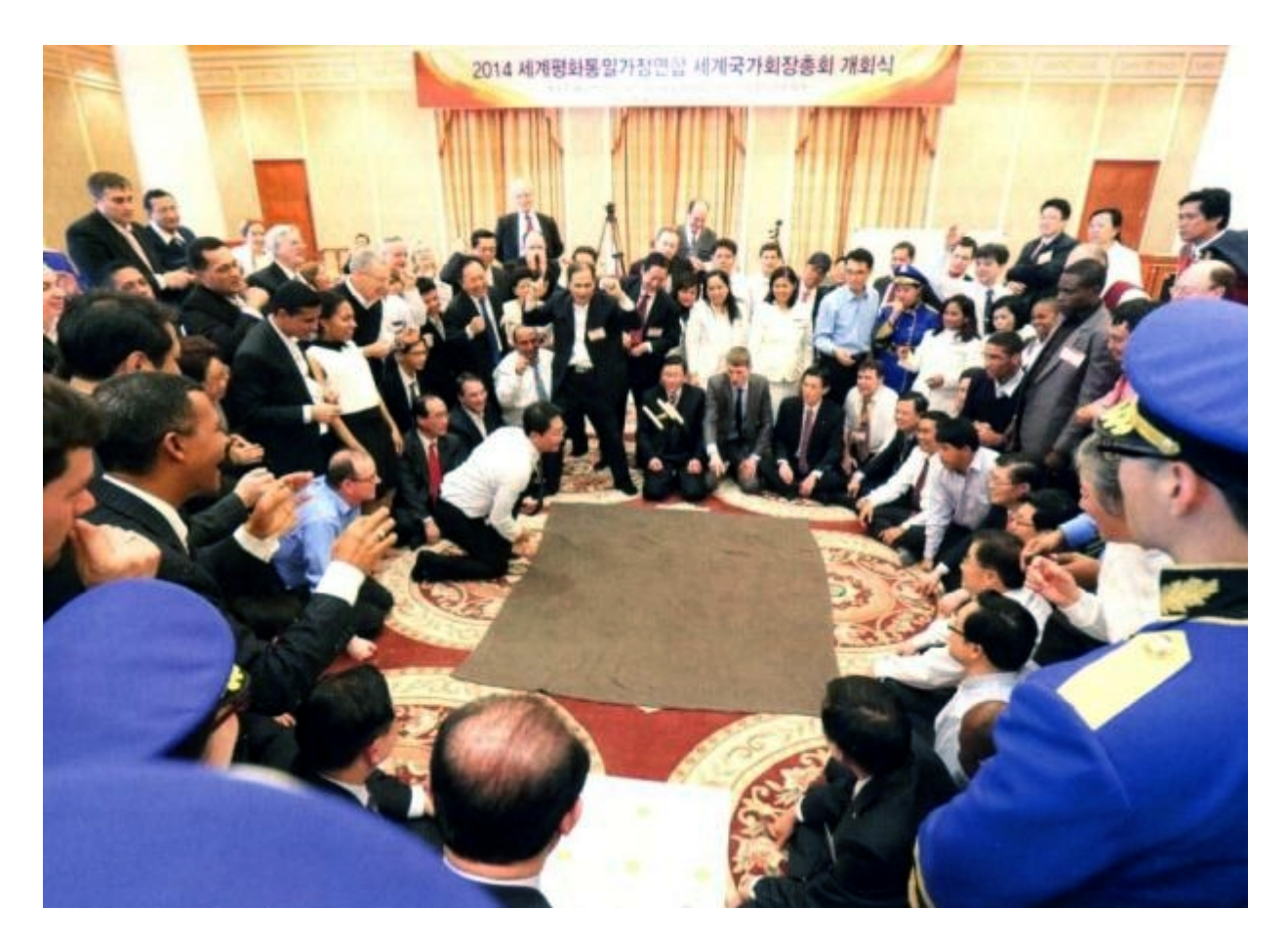
National leaders playing yute, a traditional game in Korea much loved by True Parents

As true owners, what kind of people should we become in order to open the Cheon II Guk era? Of course, we are the absolute children and absolute object partners in front of the absolute Heavenly Parent and in front of the True Parents of Heaven, Earth and Humankind. However, we should be able to understand the parental heart by ourselves from the children's position and the object partner position and be able to feel the urgency of having a parental heart. All of us here today are actually brothers and sisters. When we go to the spiritual world, we will all be brothers and sisters. Taking this into consideration, we should live for the sake of one another, love each other, raise and foster each other with a parental heart. We should feel truly happy and praise a sibling that does well and feel truly sorry for a younger sibling who is going through hardships because we were unable to take those on ourselves. We should be able to comfort siblings in difficulties and say, I'll help you. Let's go together.