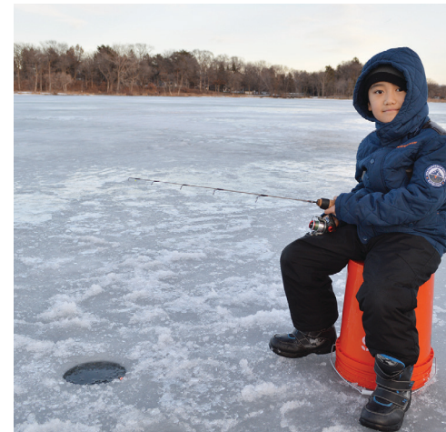
Photo credits: Children at fence, children by river — Erin D. Carter; biker, kids with bucket — FIWYGIN; kayakers — Mississippi Park Connection; caterpillar — Brett Stopelstad; ice fishing, child with telescope — Faith Krogstad