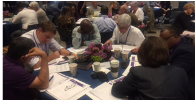
The Diocese of Georgia plans for Project Resource "rollout" in the diocese following the conference.