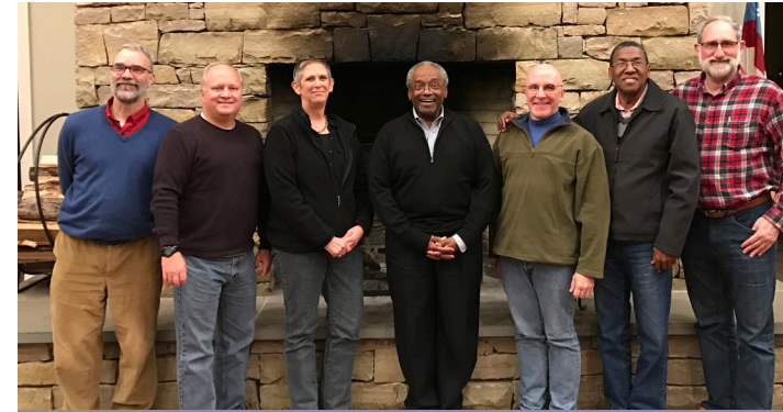
The Most Rev'd Michael Curry with the bishops from the Classes of 2015 and 2016 at the New Bishops and Spouses/Partners Conference in January of 2017