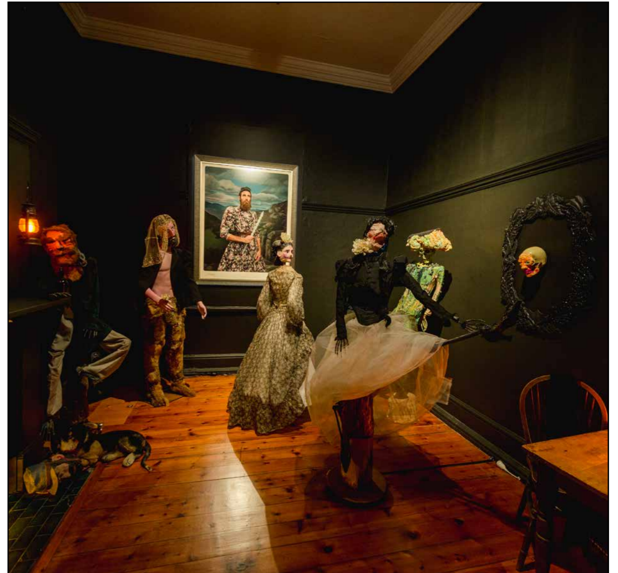
IMAGE > Jacqui Stockdale, The Outlaws' Inn [installation view], 2020.