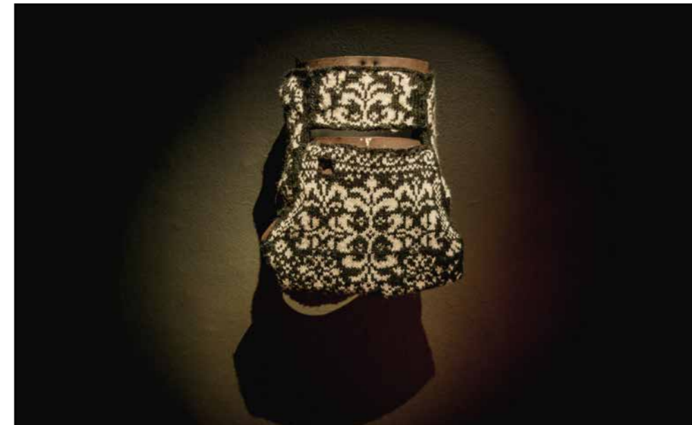
IMAGE > Jacqui Stockdale, Our Sunshine [installation view], 2020, metal and wool knitted by Melinda Christensen, 35 x 31 x 23cm.

Ma Kelly , 2020 mixed media assemblage, 128 x 58 x 86cm POA