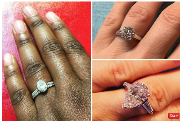
A selection of rings from Palladium.