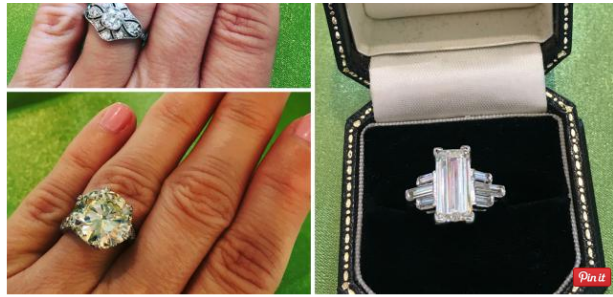
A selection of rings from Patina.

A proposal weekend in Napa Valley could involve two scenarios. One has you and your sweetie using your time there to shop for and buy an engagement ring together . The other hinges on the proposal being a complete surprise, the engagement ring having been selected and purchased in advance of the big moment. No matter what approach you take, be sure to make Patina one of your engagement ring hunting stops.