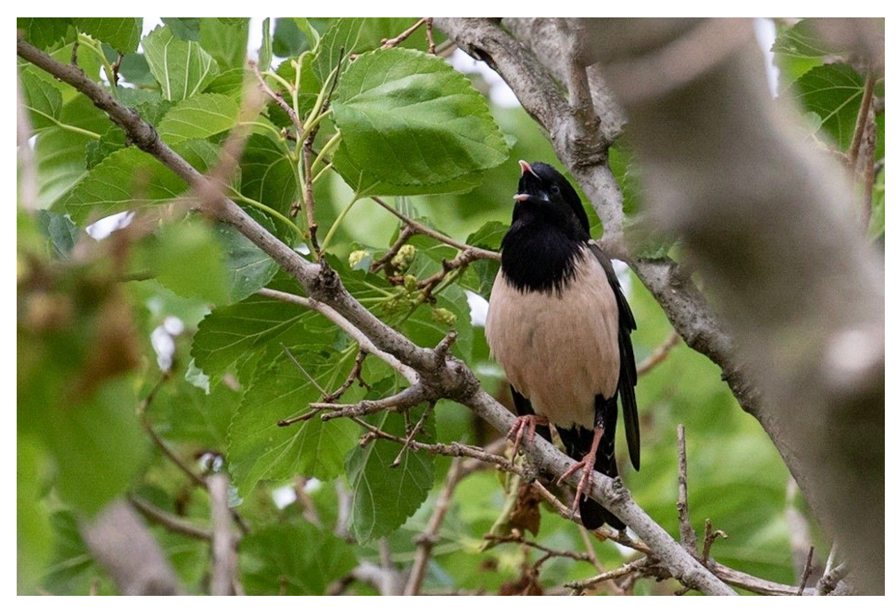
After that we bought some lunch at the grocery store (Roller en route!) and enjoyed it at the Loutros River. A Nightingale was seen by many. In Loutros proper we found Little Ringed Plover and White Wagtail.