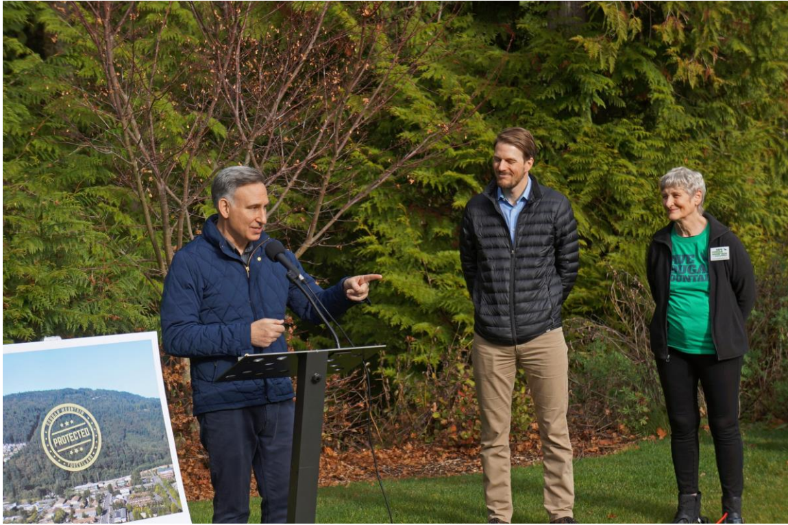
King County Executive Dow Constantine makes a point.