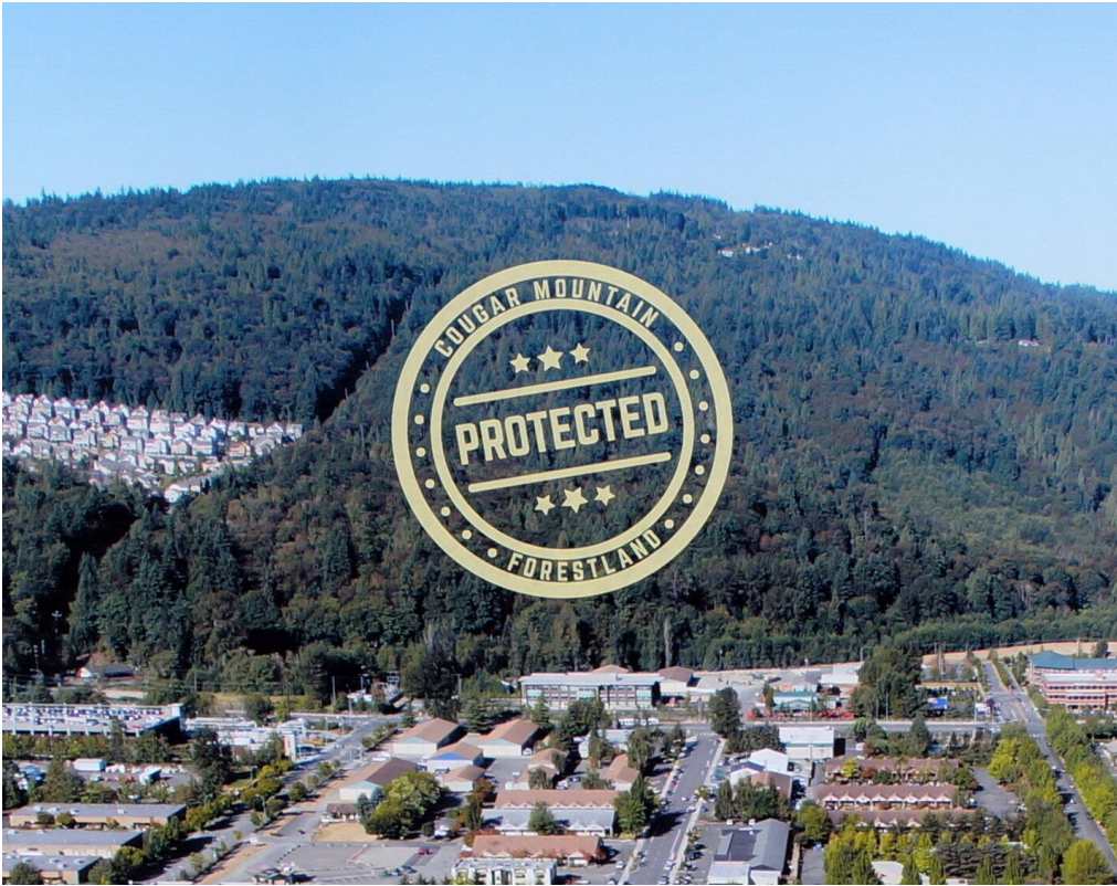
Mission Accomplished - a gem of the "Wilderness Within" protected.