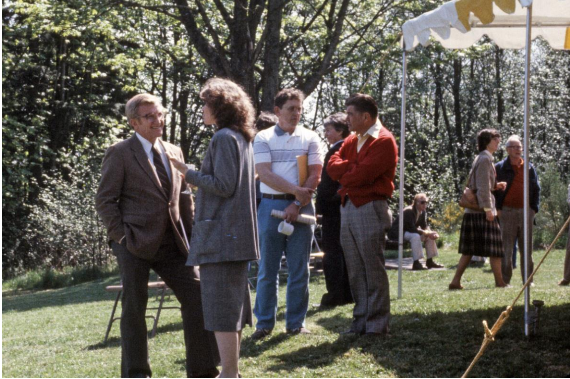
City of Issaquah Mayor AJ Culver on the left.