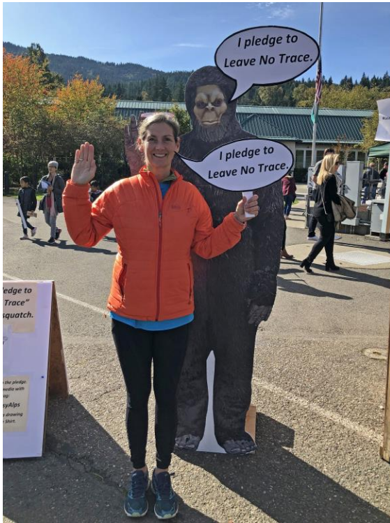
Issaquah Mayor Mary Lou Pauly takes the pledge.