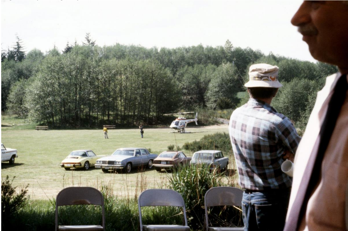
Chopper 7, even.