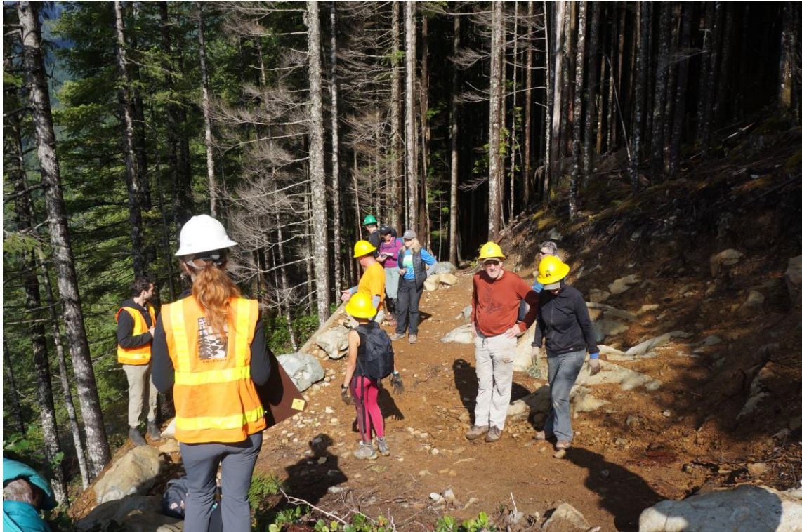
Volunteers work near the top of the Garfield Ledges Trail.