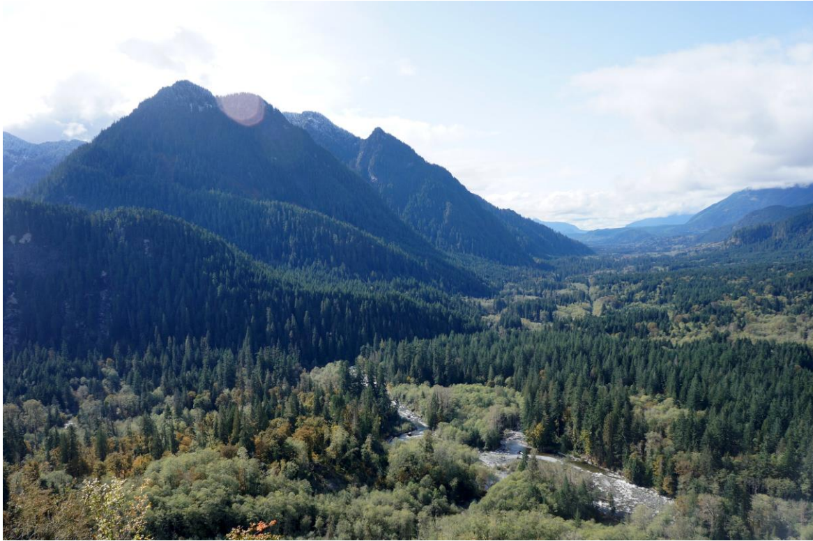
View from Garfield Ledges Trail