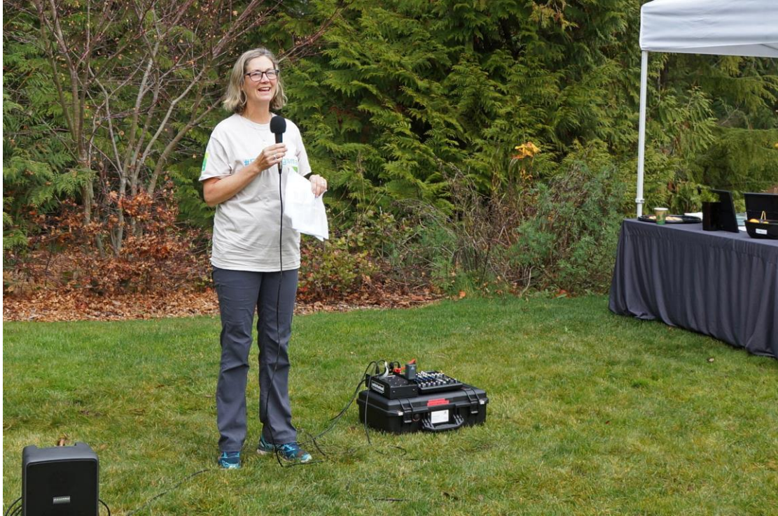
City of Issaquah Mayor Mary Lou Pauly reflects on the challenges that were met.