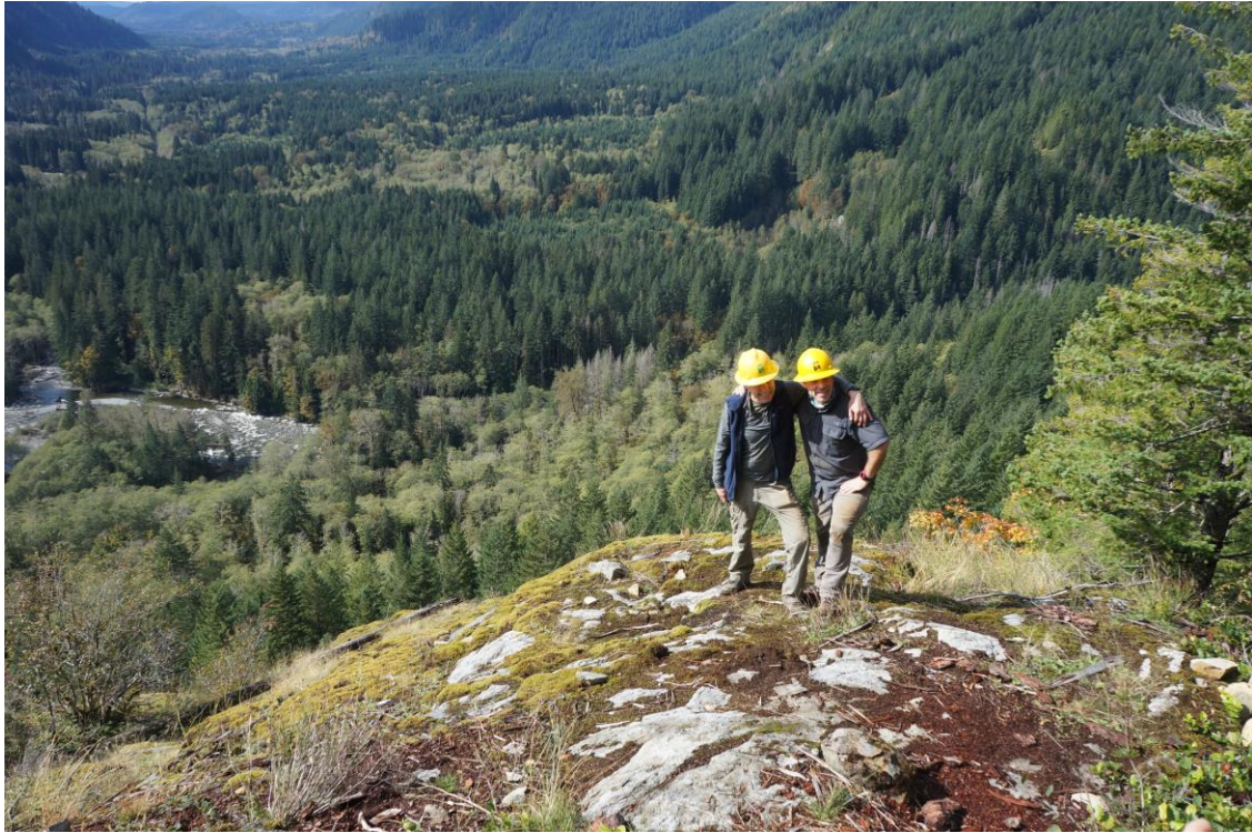
Volunteers pose at the top of the Garfield Ledges Trail.