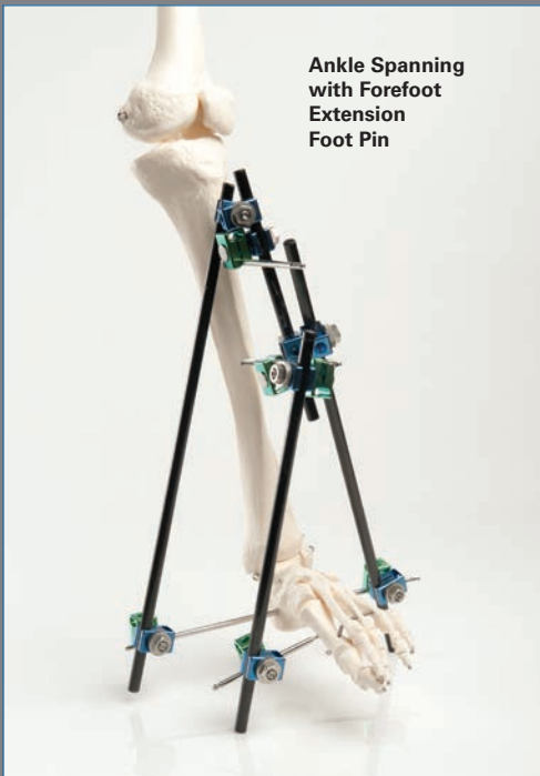
Ankle Spanning with Forefoot Extension Foot Pin