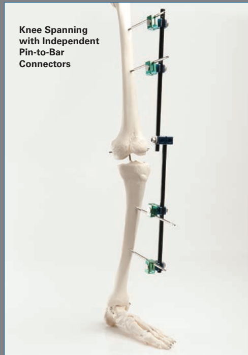
Knee Spanning with Independent Pin-to-Bar Connectors