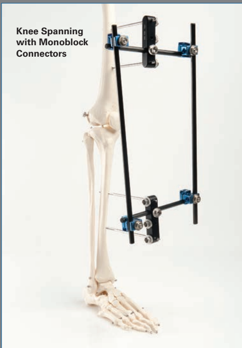
Knee Spanning with Monoblock Connectors