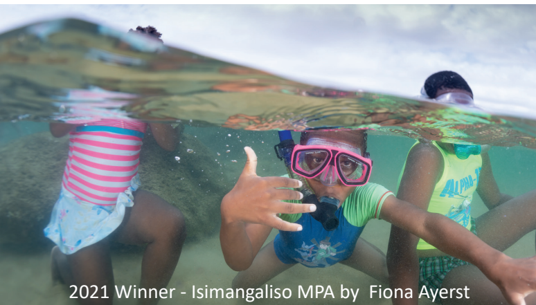
2021 Winner - Isimangaliso MPA

OUR AIM IS TO SHOW THE BEAUTY AND VALUE OF OUR MPAS AS PLACES FOR PEOPLE TO RELAX, EARN A LIVING, DISCOVER AND RESPECT.