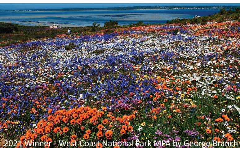
2021 Winner - West Coast National Park MPA

Photos may depict anything above or below water within a South African MPA e.g. creatures, plants, scenery, sport, recreation, tourism and research.