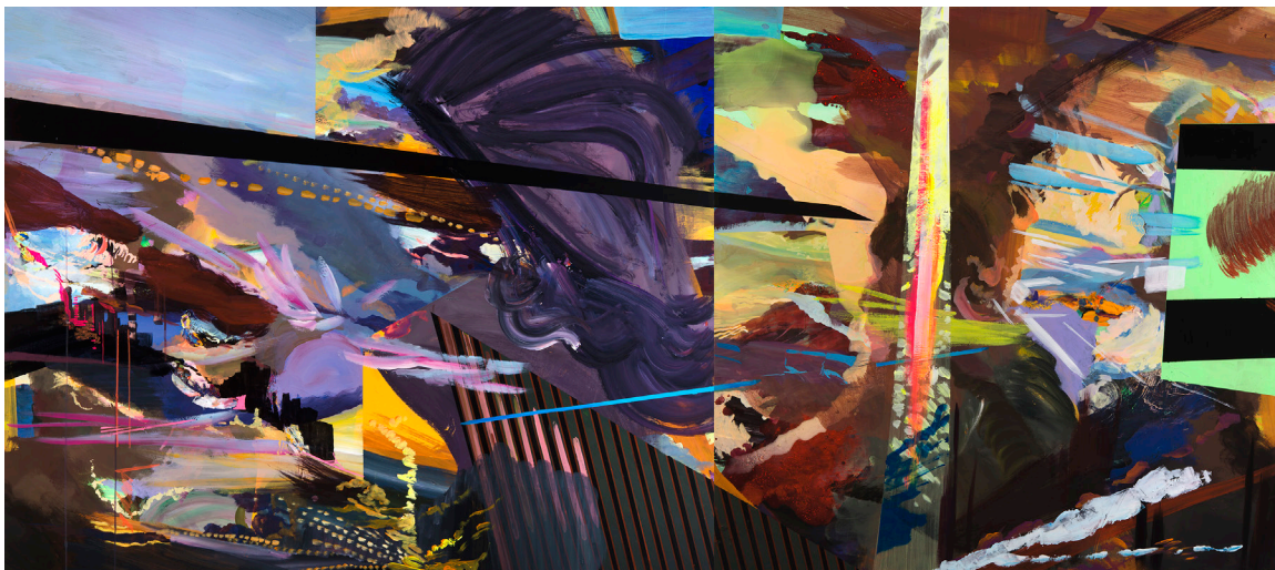
Squint , 2016 Flashe acrylic, acrylic on panel 48 x 108 in $11,000