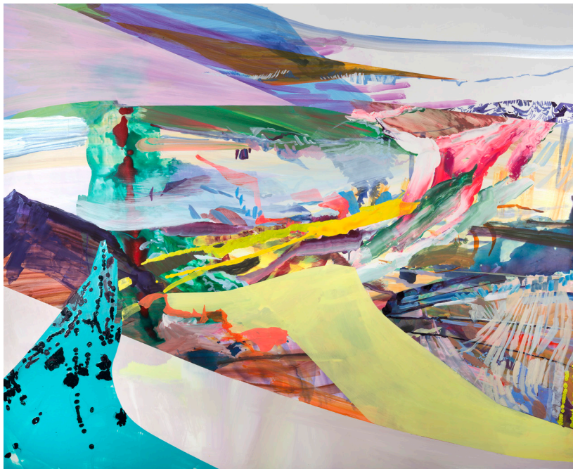
Out of Range , 2017 Flashe acrylic, acrylic ink on panel 48 x 60 in $5,800