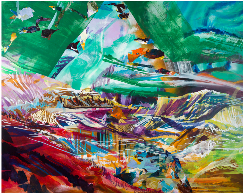
Bigger Picture , 2017 Flashe acrylic, acrylic medium, acrylic ink, acrylic guache on panel 48 x 60 in $5,800