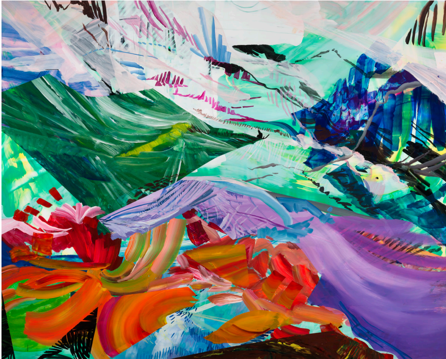
Reversed Course , 2017, flashe , acrylic medium, guache, and acrylic ink on panel, 48 x 60 in, $5,800