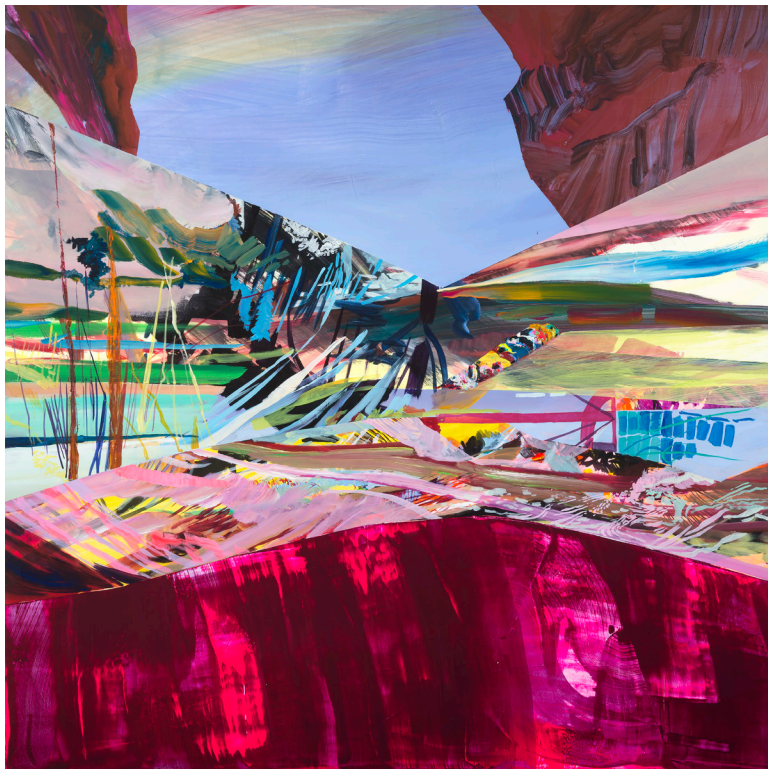
Backtrack , 2017 Flashe acrylic, acrylic ink on panel 48 x 48 in $5,500