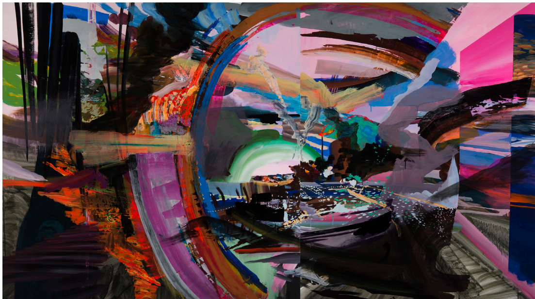
Burst , 2016 Flashe acrylic on panel 60 x 108 in $12,000