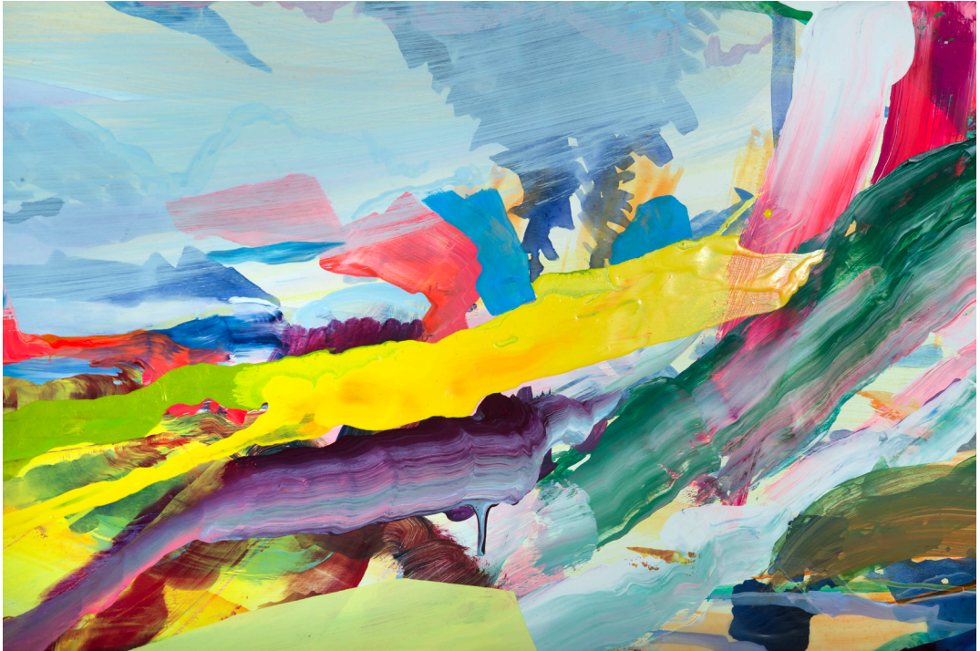
Out of Range, detail