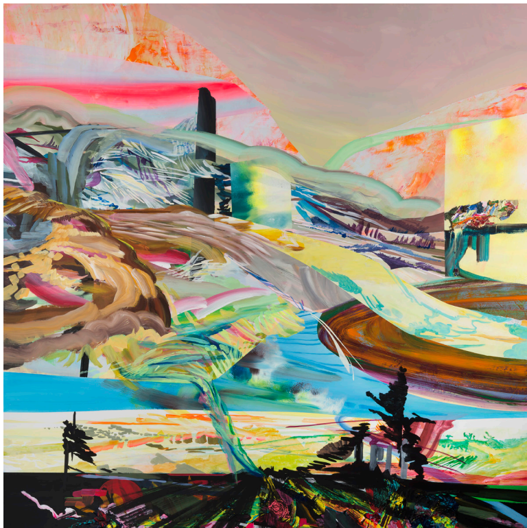
Forgotten History , 2017 Flashe acrylic, acrylic medium, acrylic guache, acrylic ink on panel 60 x 60 in $6,500