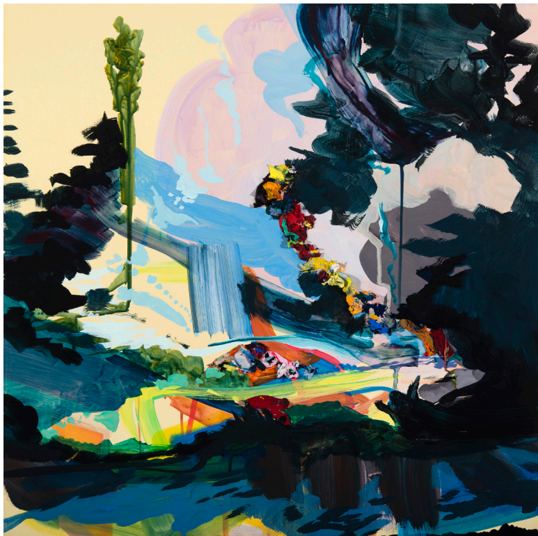
Rendering , 2015 Flashe acrylic, acrylic guache on panel 20 x 20 in $3,000