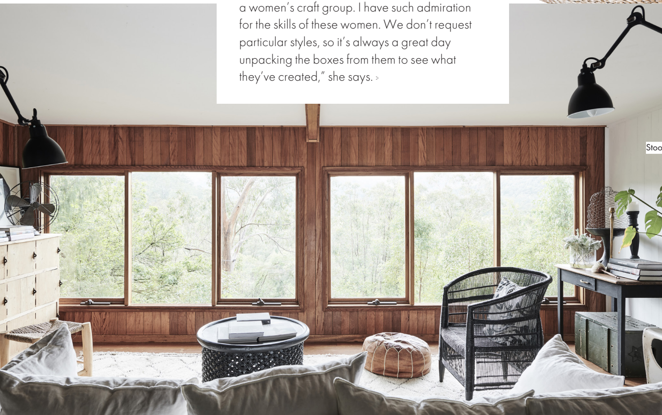
VALLEY GIRL: A perfect nook for Walton to take in the treescape (no TV necessary)