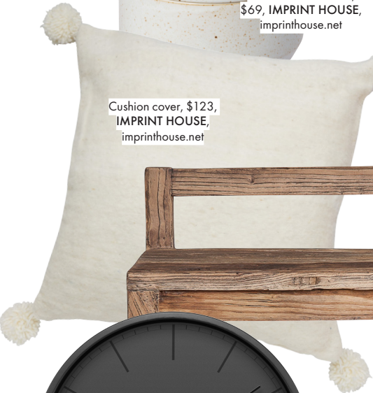
Cushion cover, $123, IMPRINT HOUSE , imprinthouse.net