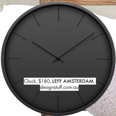
Clock, $180, LEFF AMSTERDAM , designstuff.com.au