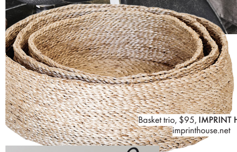
Basket trio, $95, IMPRINT HOUSE , imprinthouse.net

When she's not writing about other people's dwellings, Walton is busy running Imprint House, or opening up the IRL version, which is located in a converted barn near the house. "It feels like such a long time since I've specifically bought something for our home. Before we moved to the country, I went through our collections and we only packed what we truly loved. But some pieces do make their way up the hill from the shop. Sometimes practical, other times it's something more decorative like the Inongo baskets from Zimbabwe that we sourced from a women's craft group. I have such admiration for the skills of these women. We don't request particular styles, so it's always a great day unpacking the boxes from them to see what they've created," she says. >