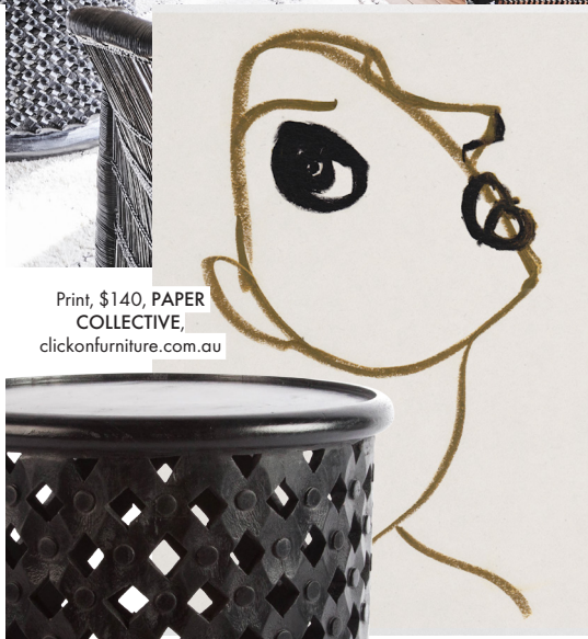
Print, $140, PAPER COLLECTIVE, clickonfurniture.com.au