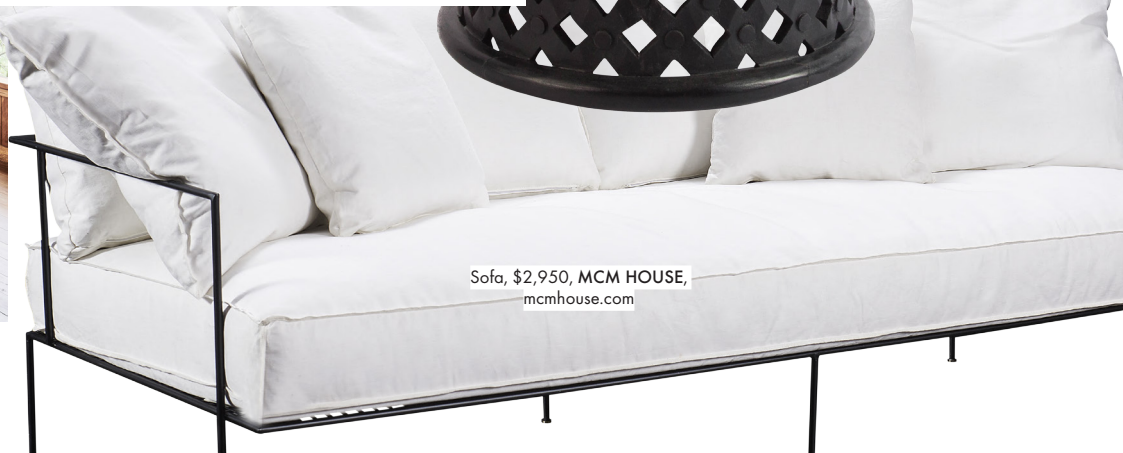
Sofa, $2,950, MCM HOUSE, mcmhouse.com