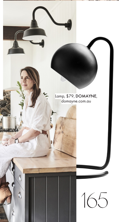
Lamp, $79, DOMAYNE , domayne.com.au

The home, built in the '80s, needed only simple cosmetic tweaks when Walton took possession of it. The family neutralised the bold feature walls and added as much white as they could. Their most recent changes have been to the kitchen. "I try to take cues from the original style of the building and the local environment," says Walton. "We wanted to update the kitchen so it was in keeping with the rest of the house, and the country location. We added timber benchtops, aged brass handles, timber panelling and barn lights." >