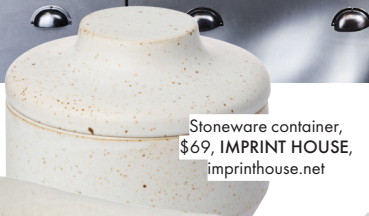
Stoneware container, $69, IMPRINT HOUSE , imprinthouse.net