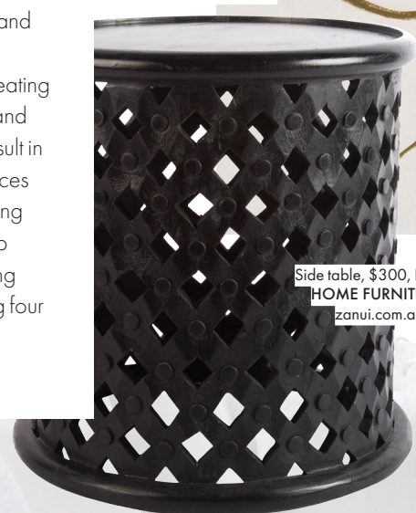
Side table, $300, HURRY HOME FURNITURE, zanui.com.au