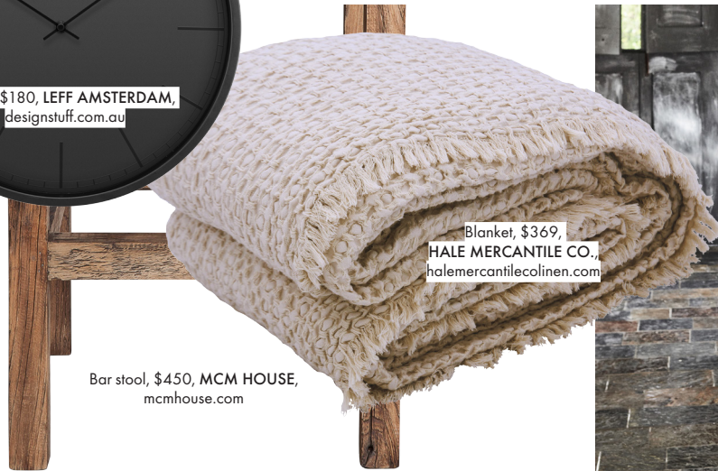
Blanket, $369, HALE MERCANTILE CO. , halemercantilecolinen.com