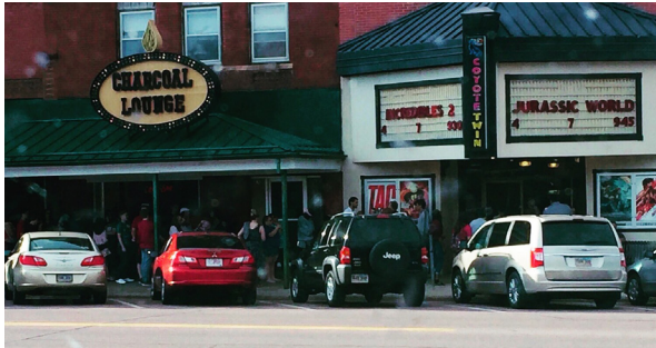
Moviegoers line the block on a June evening of soldout shows.

Welcome to the inaugural issue of our quarterly newsletter—we hope it finds you well. In the last few months, the Vermillion Cultural Association has experienced some unprecedented successes, confronted a few challenges, and welcomed new talent and energy.