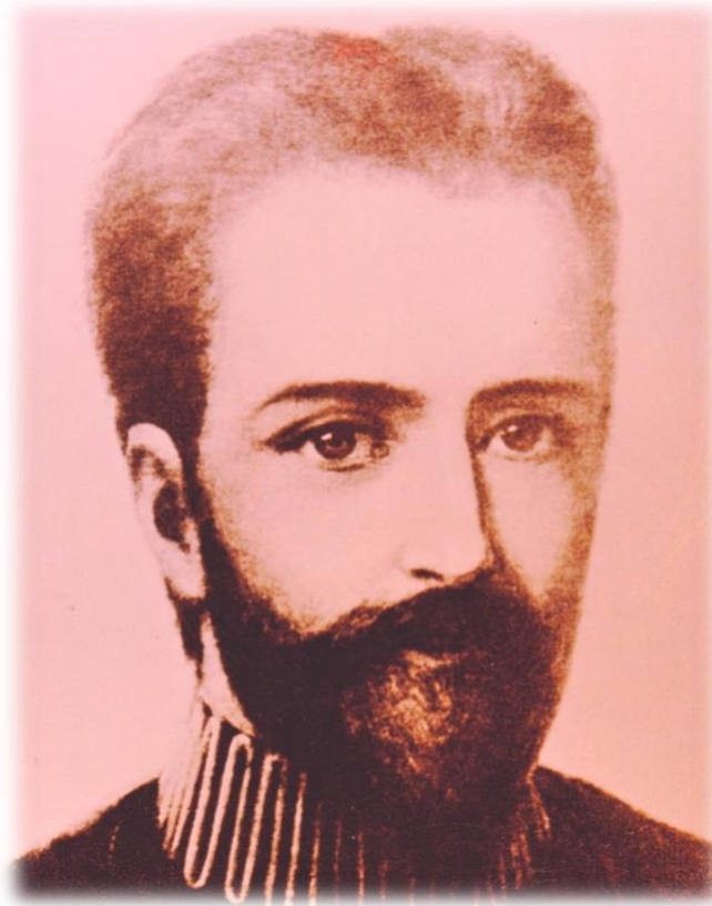
THE BELOVED ASCENDED MASTER SAINT GERMAIN

The great Ascended Master known as El Morya has long served humanity. He brought forth The Bridge to Freedom activity to assist Saint Germain in the gigantic task of setting all life free from that which has bound them for so long. All the Ascended Host are working together in love and harmony to bring this about.