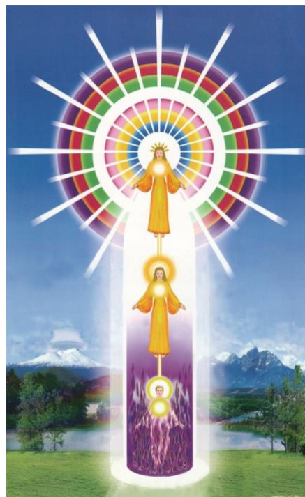
THE "I AM" PRESENCE