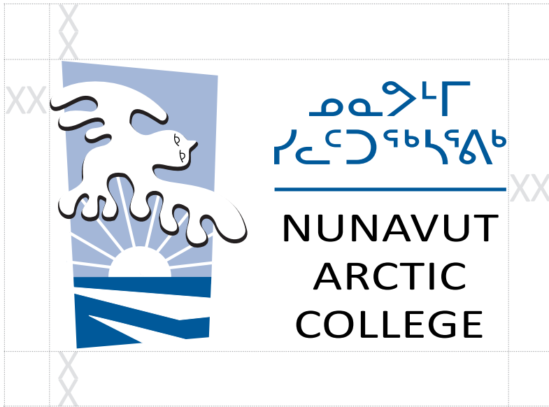
SAMPLE OF SAFE ZONE AROUND LOGO

It's important to ensure that the NAC logo stands out on the page, and that it is not crowded by other text, images or elements. For this reason, we ask for a 'safe zone' to be created around the logo.