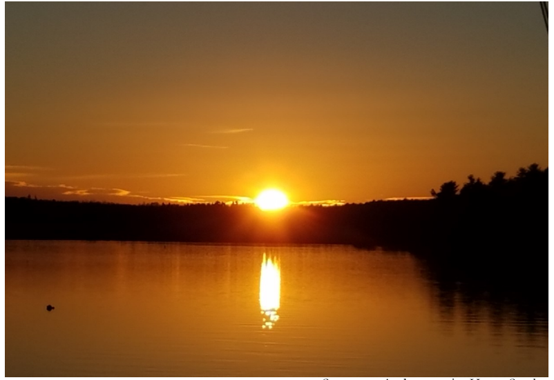
Sunset on Androscoggin